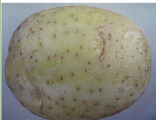
Upper Limit - U.S. No.1 Potato

The USDA Grade Requirements for potatoes define damage in a U.S. No.1 potato as enlarged lenticels that "materially detract from the appearance of the potato". Damage to a U.S. No.2 potato is defined as that which "seriously detracts from the appearance of the potato". Photos of the maximum allowable damage to a U.S. No.1 and a U.S. No.2 potato are below: