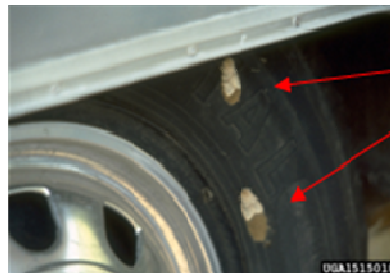
Female Gypsy Moths laying eggs on a tire.

And please remember, Gypsy Moths are not the only invasive species that can "Hitchhike" their way to Alaska. Thank you for your cooperation.