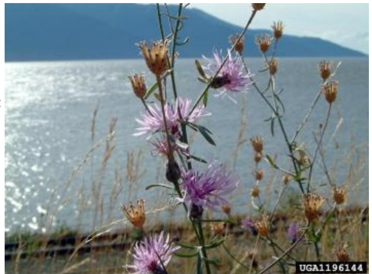
Spotted Knapweed at Beluga Point, on the Seward Highway. Please report this plant if seen in Alaska, ideally by e-mailing PMC staff a photo for identification, or by calling 1-877-INVASIV.

Knapweed is widespread in North America and especially problematic in the northwest where it displaces important forage species and increases soil erosion. Ten known populations exist in Alaska, where seeds were likely introduced by vehicles and heavy equipment. A coordinated eradication effort is underway.