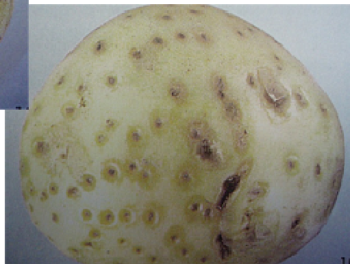
Upper Limit - U.S. No.2 Potato