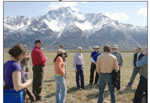
Weed Free Forage and Gravel Certification training at the Alaska Plant Materials Center

Those who successfully completed the exam at the end of the class will soon be certified to inspect fields and material sites for both the Weed Free Forage and Gravel Certification Programs.