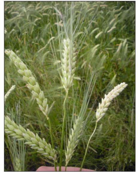
Barley from the Alaska Plant Materials Center

The Plant Materials Center's seed sale makes high quality certified seed available to Alaskan agricultural producers each spring and fall. The next scheduled open request period is September, 2012. Details will be listed on the PMC website, at plants.alaska.gov .