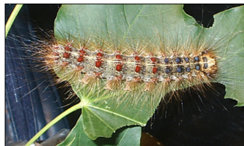
Lymtria dispar, Gypsy Moth caterpillar