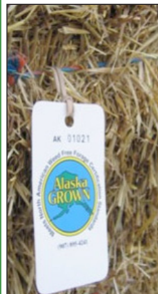
Certified Weed Free Forage Tag