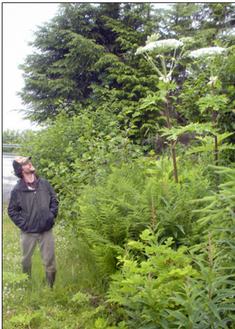
Giant Hogweed was found in Kake, AK in 2010.