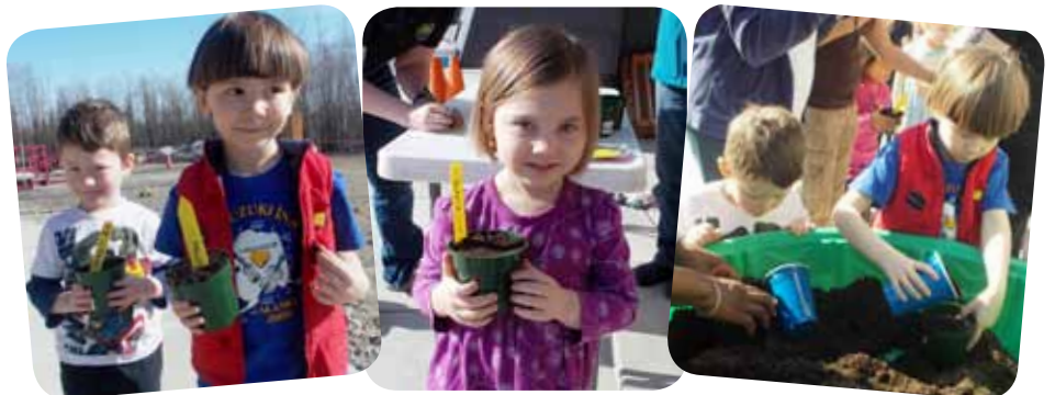
Students from Fairbanks Montesorri School learn why it is important to use Certified Seed Potatoes, how to plant potatoes, and how to make healthy potato food choices.