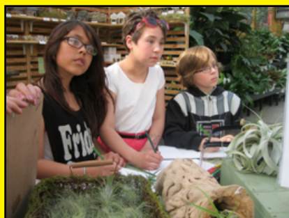
Students from Airport Heights Elementary School have a plant ecology lesson at Green Connection