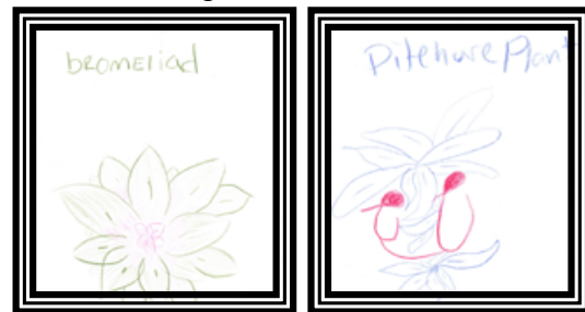
Sample artwork from Airport Heights Elementary School Students