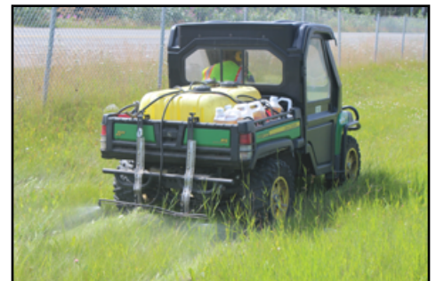
Gary Lund of Chugach Yard Care staff sprays herbicide on Canada thistle priority sites in an effort to prevent spreading to agricultural land.