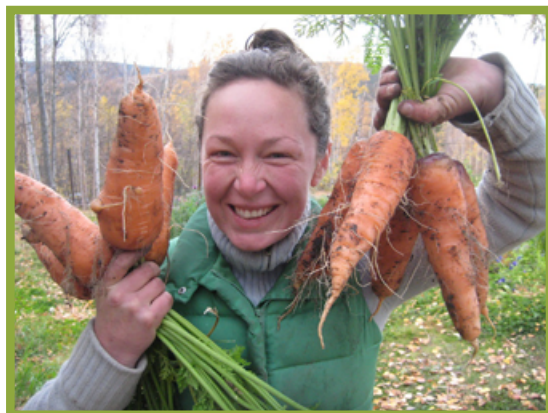
A farmer-in-training is delighted with the carrot haul at Calypso Farm in Ester.