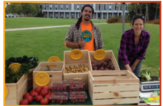
The UAA Farm Stand pilot study.

Another federal funding source at the Division of Agriculture is the Specialty Crop Block Grant Program. Thanks to this funding we have been able to run a number of popular programs in the past such as Restaurant Rewards and Chef at the Market. While those two programs are coming to a close we are looking forward to an upcoming Farm to University/Hospital grant cycle. We just finished the UAA Farm Stand pilot project to see if this kind of a grant opportunity would be feasible in the University setting.