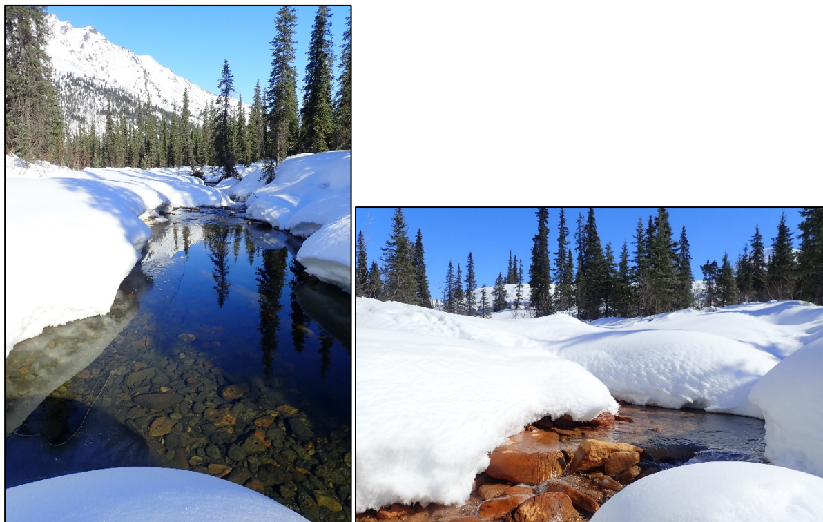
Figure 3. (L to R) Lower Red Rock and Upper Red Rock sampling locations, April 2022.