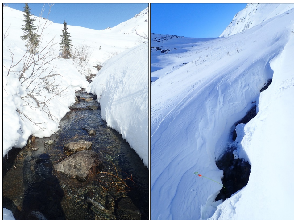
Figure 4. (L to R) Lower Center of the Universe and Upper Center of the Universe sampling locations, April 2022.