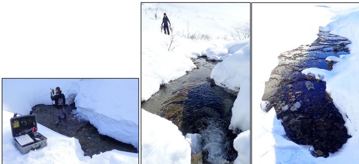
Figure 2. (L to R) Lower Subarctic, Middle Subarctic and Upper Subarctic sampling locations, April 2022.