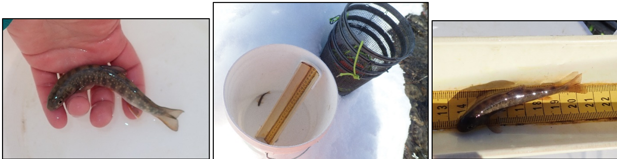
Figure 5. Examples of the Dolly Varden captured in Subarctic and Red Rock creeks, April 22, 2022.

a Ambler Metals water station names in parentheses.