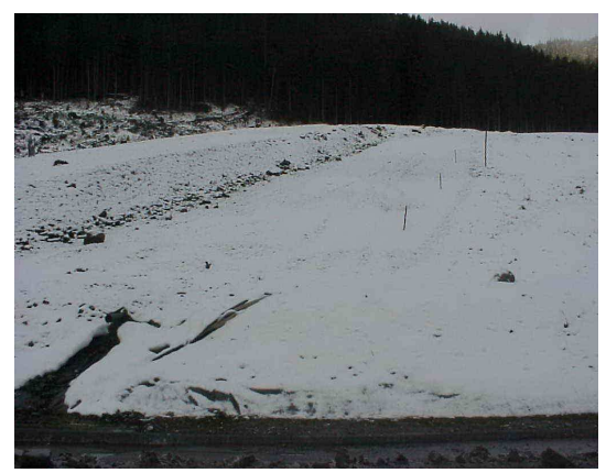
Production Rock Site 23 - Final Cover Test Plot Showing Exposure At Sides To Air

The test plot is relatively small and accessible to air on all sides of the test plot. Therefore, according to site operations staff, the implementation of direct oxygen monitoring would likely result in inaccurate results because of the lateral diffusion of air below the installed barrier layer.