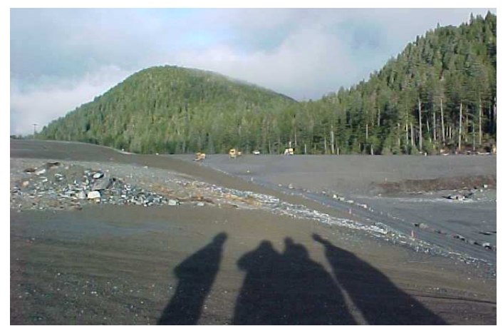
Central Portion (left) and Eastern Portion (right) of Tailings Disposal Facility

Landfill capacity is an issue as the site has achieved maximum vertical height in the south section of the landfill. Soon the eastern expansion will achieve maximum height as much disposal has occurred in this section over the past year. In January 2002 the Department and the USDA Forest Service approved a liner design for the Wide Corner (southeastern aspect). Tailings placement in the Wide Corner area will likely be available in the spring of 2002 after the liner is installed. Development in the Wide Corner and West Buttress areas during the next year should provide sufficient disposal space during the time the EIS for Stage II of the tailings project is completed (3<sup>rd</sup> quarter 2002).