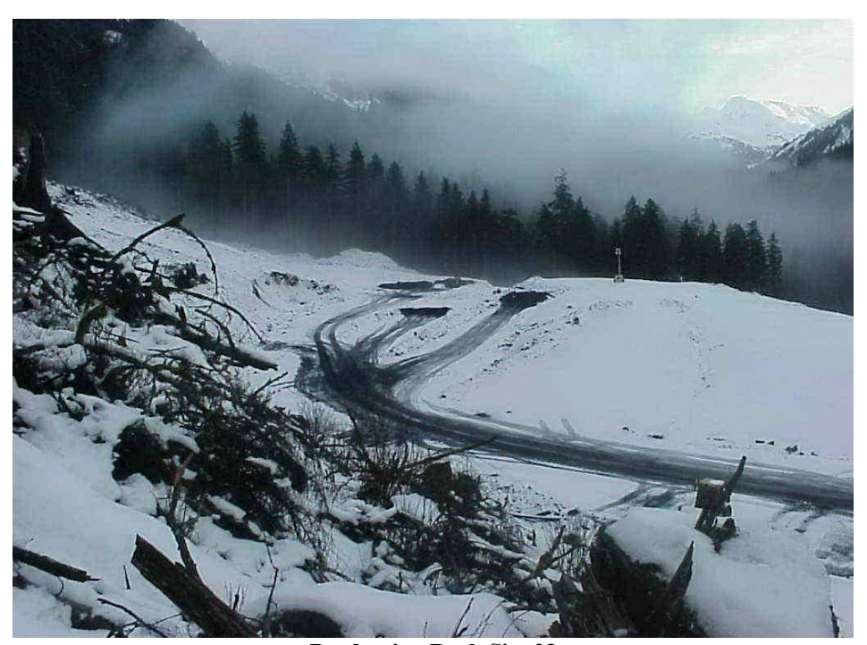
Production Rock Site 23

This past year, approximately 53,000 tons of production rock was disposed at Site 23 and 157,000 tons were placed underground.