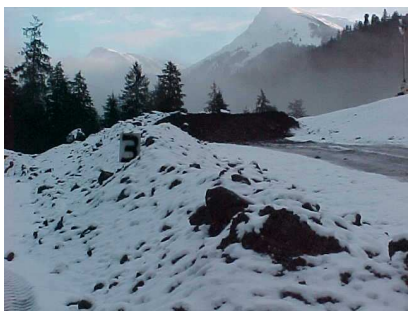
Disposal of Class I Waste Rock