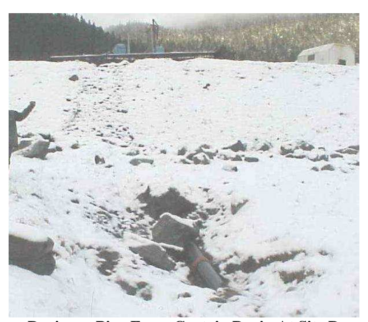
Drainage Pipe From Curtain Drain At Site D

During the inspection we took a look at the exposed pipe from the Site 23 curtain drain. Sampling the water in this pipe would enable us to understand the chemical composition of the water that enters this drain from Site 23. This exposed portion of the drain pipe should be added to the internal monitoring program and sampled according to the internal monitoring program for the facility as prescribed in the General Plan of Operations.