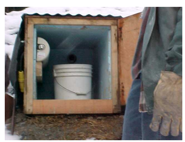
Production Rock Site 23 - Lysimeter Drain at Final Cover System Test Plot

Demonstrating the effectiveness of this soil cover system would be advantageous with the complete closure of Waste Site "E" or some other site with acid producing potential. Completely closing a site on all sides would allow for the effective establishment of the soil cover as well as installing monitoring devices or access tubes for direct oxygen readings could enhance the demonstration of the final cover system performance.