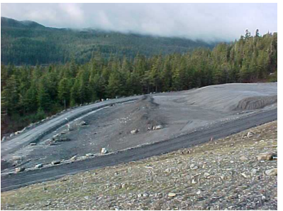
Duck Blind Drain Area Further Seep Drainage Area Northwest Tailings Area (West Buttress) Downgradient Western Area Of The Tailings Disposal Facility

In a January 2002 report, KGCMC provided the Department its latest assessment and action plan of these anomalies west of the current tailings disposal facility. The information obtained during the ongoing investigation provides a good discussion of geochemical and hydrological behavior