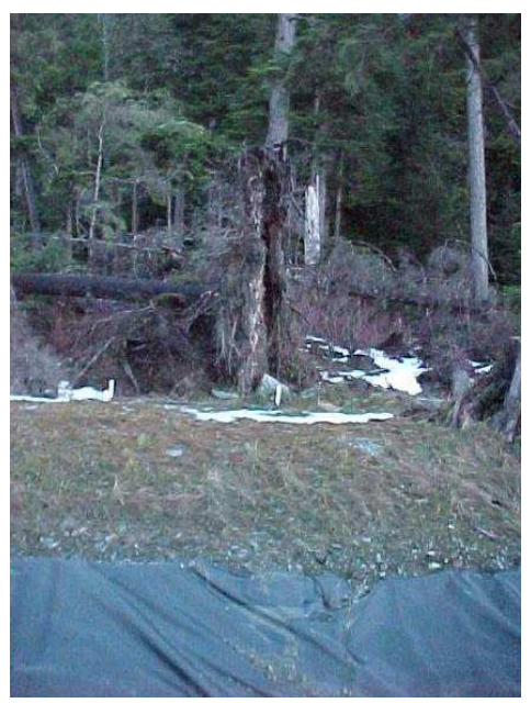
Uprooted Tree Above Tailings Site

Qualified personnel should explore long-term issues related to tree blow-down and relate this information to the final cover system for the facilities at Greens Creek in a more quantitative manner. Issues to be explored should take into account at a minimum the age of trees and soil conditions of the growth layer at blow-down. If it is found the growth layer deteriorates over time, then a plan should be developed that minimizes or prevents tree growth or "blow-down" of trees.