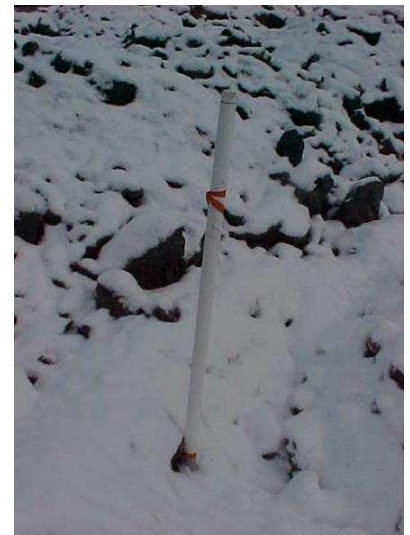
Run-on at Finger Drain