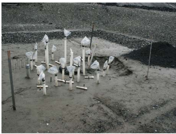
Sinkhole in southernmost cell