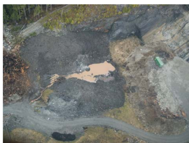
Aerial view of Pit 7.