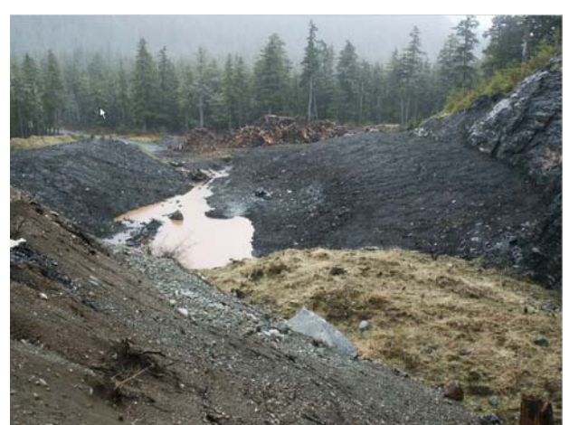
Pit 7 – organics & runoff.

This pit is on the "A" road. Organics such as muskeg have been placed in the pit for storage purposes. It could be seen that a lot of iron and manganese were being released from the organics.