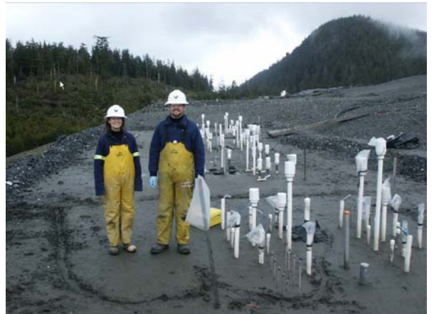
University of Waterloo technicians

The SRMP units were being worked on (data collected) by the University technicians. The far cell had a depression, most probably from a cavity between the cell fabric and the native tailings, and the tails in the cell settled. This cavity will be filled in so that it does not form a sump for surface runoff.