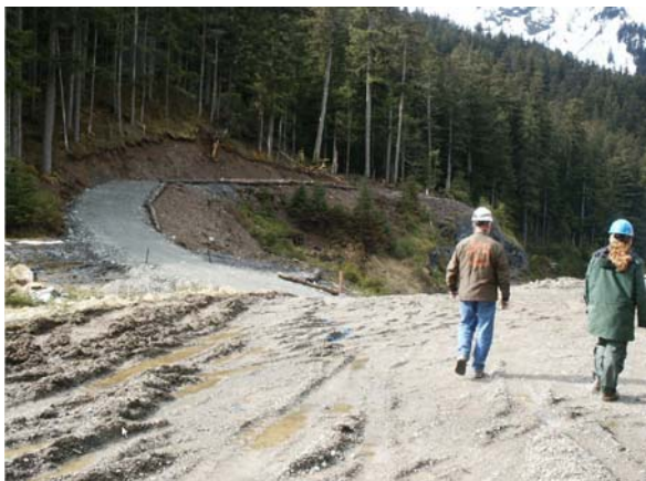
Area at Site 1350 where material removed.