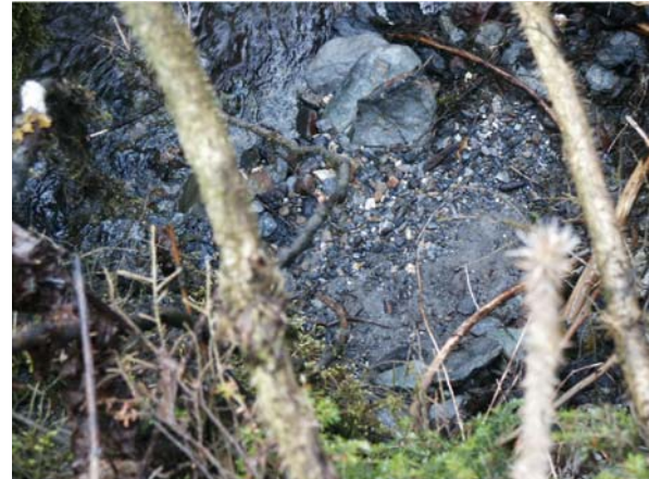
Sediment (which looked like natural sediment) and rocks in the creek.