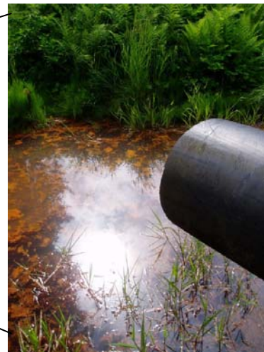
Figure 11. Pond D Outlet. Note orange color of water.

An orange colored precipitate/staining was observed in the water below the Pond D berm at the discharge of the drop inlet spillway, as seen in Figure 10 and 11. The berm at the lower aspect of Site D was constructed to contain the surface and groundwater runoff from Site 23/D and to provide sedimentation control. The berm contains some pyritic quarry rock from the development Pit 405 in 1988. The water was clear. The orange color appeared to result from the sediment and biological growth that settled on the bottom of the pool. Efforts are taken to drain down Pond D to the maximum extent possible. At this visit a minimal amount of water storage was observed in the upper compartment. At the time of this site visit there was no apparent evidence of seeps through the berm, as active pumping maintains the pond empty or very low other than during major storm events.