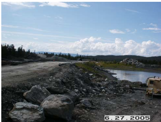
Figure 2. Upper Cannery Tailings Dam.

Pond 6 was observed including the Upper Cannery Tailings Dam (National Inventory of Dams number AK00203) which is under jurisdiction of the Alaska Dam Safety Program, as seen in Figures 2 and 3. The water level in the pond was low, and water was observed entering the system from the tailings pile underdrains. The dam and spillway appeared to be in good condition. Pond 6 is scheduled to be removed from service and used for tailings storage as part of the Stage 2 expansion.