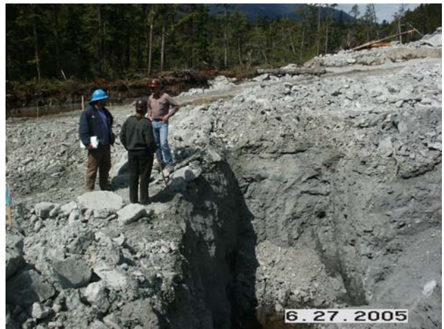
Figure 7. Pond 7 Wet Well Excavation