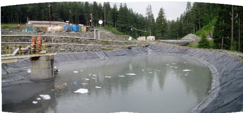
Figure 12. Pond A. Note proximity to bridge over Greens Creek to portal.

The remediation plan for the Pond D berm will result in its being removed within a few years, following completion of other priorities, such as a pumped water return system from Pond C. Plans include reconstructing the berm with inert material; a possible source is material recovered from the continuing development of the upslope of Site 23.