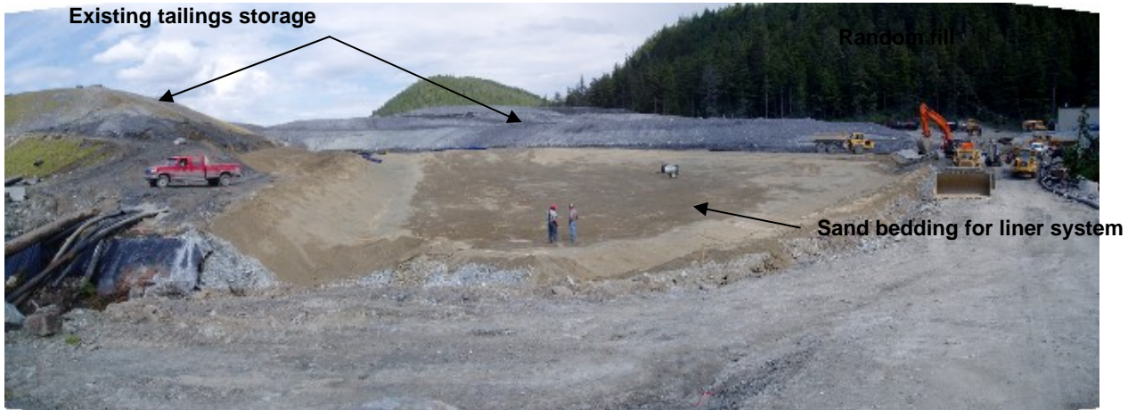
Figure 1. Tailings Disposal Site – Southeast Expansion Area 2 (looking northeast from Pond 6)