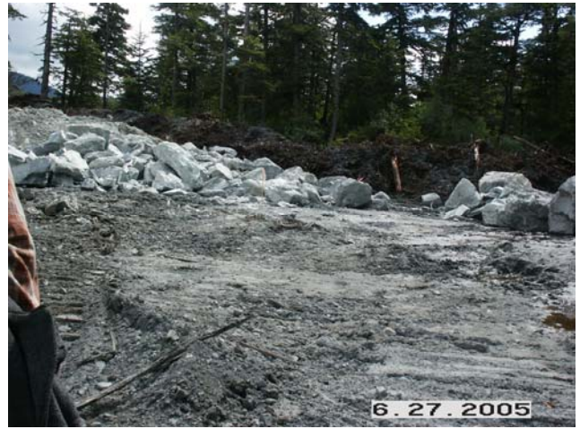
Figure 5. Oversized rock in fill at Pond 7 Dam

We then proceeded to the Pond 7 area that was being excavated and prepared as a stormwater retention pond according to the 2005 work summary. We observed the HDPE components and foundation for a wet well that will be installed in Pond 7, and the portions of exposed foundation and fill placement for the Pond 7 Dam (National Inventory of Dams number AK00307). This dam will be under the jurisdiction of the Alaska Dam Safety Program and a Certificate of Approval to Construct a Dam has been issued by ADNR. The area of the spillway was also observed, but a substantial amount of excavation still needed to occur. Some oversized rock was observed in an area of fill. The foundation excavation and construction of the dam and liner system for Pond 7 will be completed over the 2005 construction season. Pond 6 will continue to operate until Pond 7 is commissioned, and will be used for additional operational storage until it is to be used for tailings disposal.