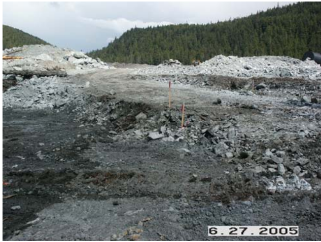
Figure 4. Pond 7 Dam Excavation and Fill