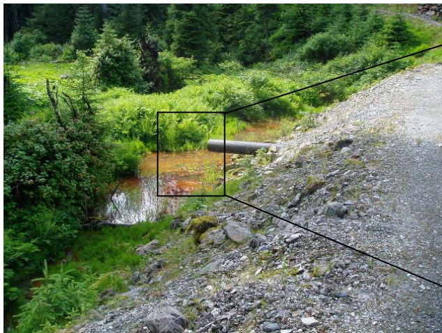
Figure 10. Pond D Spillway Outlet

At Site D, placement of native glacial till excavated from the mill during site development is overlain by waste rock, as seen in Figure 8. Recent investigative field work and data analysis associated with hydrology, geochemistry and geotechnical stability suggest that there may be long term advantages to relocating the production rock placed at Site D. Field work and data analysis is continuing to identify potential risks and benefits with either leaving the site at the current location or moving the material elsewhere. We observed red staining of the rock in the outer buttress that is most likely due to lichen growth, as seen in Figure 9.