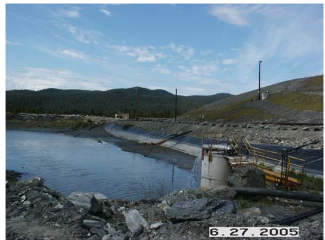
Figure 3. Pond 6