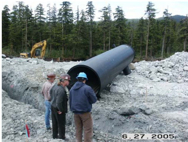
Figure 6. Pond 7 Wet Well

We then proceeded to the Pond 7 area that was being excavated and prepared as a stormwater retention pond according to the 2005 work summary. We observed the HDPE components and foundation for a wet well that will be installed in Pond 7, and the portions of exposed foundation and fill placement for the Pond 7 Dam (National Inventory of Dams number AK00307). This dam will be under the jurisdiction of the Alaska Dam Safety Program and a Certificate of Approval to Construct a Dam has been issued by ADNR. The area of the spillway was also observed, but a substantial amount of excavation still needed to occur. Some oversized rock was observed in an area of fill. The foundation excavation and construction of the dam and liner system for Pond 7 will be completed over the 2005 construction season. Pond 6 will continue to operate until Pond 7 is commissioned, and will be used for additional operational storage until it is to be used for tailings disposal.