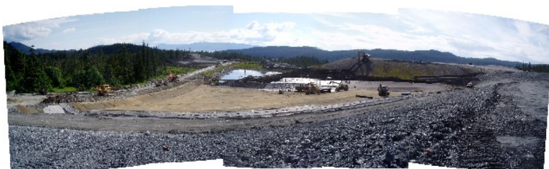
Figure 13. Liner installation at Southeast Expansion Area #2 of Tailings Storage Facility

At about 3:30pm we visited Pond A at the mill area. Pond A is part of the “closed” system that captures waters which contain sediments from the mill area. Runon into Pond A is limited by diversion ditches above the mill. Water captured in Pond A is transmitted to treatment at Pit 5. When sediments build within the pond and other containment structures in this area they are collected and taken back to the mill or taken to the tailings disposal site. Pond A is formed by an embankment adjacent to Greens Creek, as seen in Figure 12.