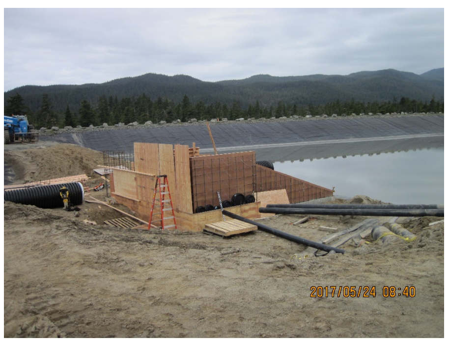
Photo 3. Once completed, this concrete flow control structure will monitor and distribute water conveyed from the mine property. Water from Pond 23 will eventually flow around the southern edge of the TDF and into this area, where it can be diverted to either Pond 7 or Pond 10. Four 36" culverts, located west (to the left) of this structure will connect the two ponds.