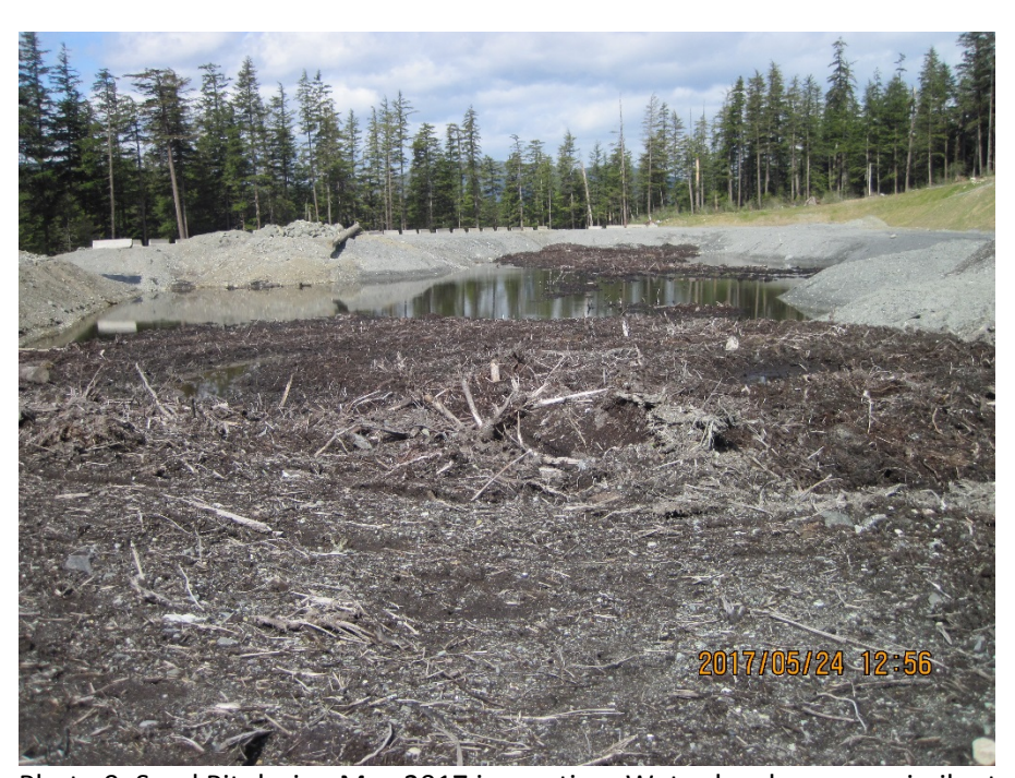
Photo 9. Sand Pit during May 2017 inspection. Water level appears similar to that in October 2016 (Photo 8), although compaction of organic material has occurred since then. Photo faces north. HGCMC has since dropped the water level through pumping.