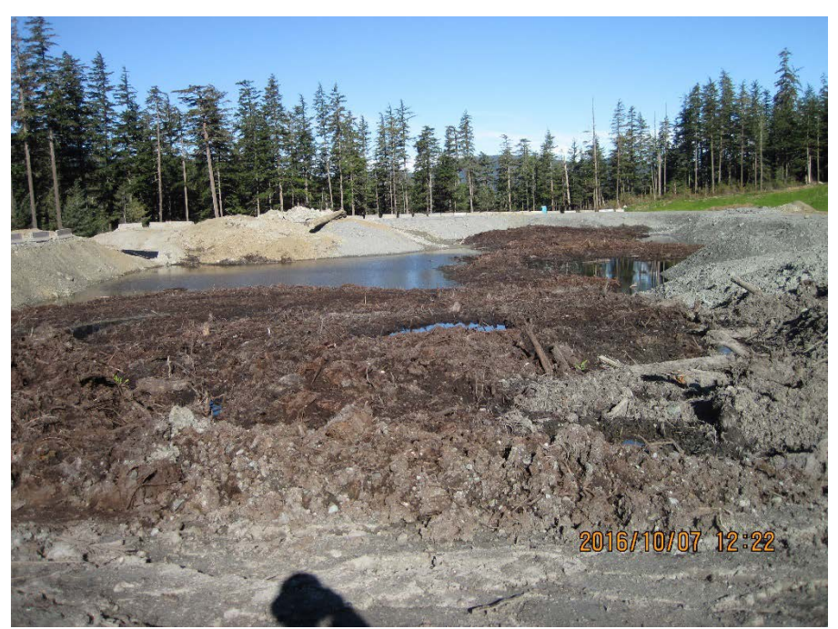
Photo 8. Sand Pit during October 2016 inspection. Note ponding in background. Photo faces north.