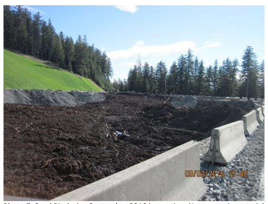
Photo 7. Sand Pit during September 2016 inspection. Note organic material covering entire pit floor and very little ponding at the surface. Photo faces south.