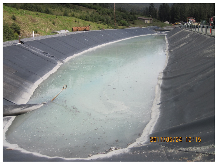
Photo 6. Pond 23 collects water and can convey it either to the Mill for recycling or to Pond 7 for eventual treatment and subsequent discharge.