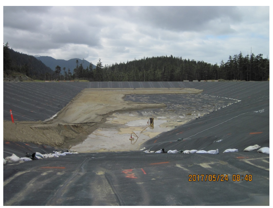
Photo 5. Looking south into Pond 10. A service layer of sand allows maintenance within the pond. Black intake pipe in the foreground can convey water to Wet Well 10 (located west of the pond).