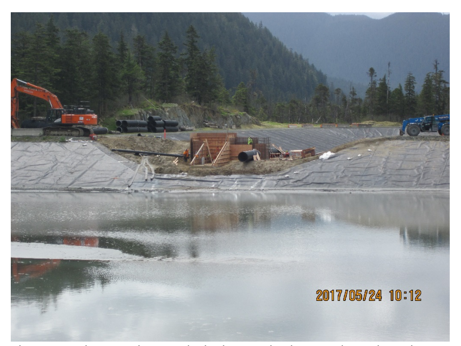
Photo 2. Looking south towards the barrier dividing Pond 7 and Pond 10. Storage capacity of Pond 7 was temporarily limited during construction. Four culverts (elevation 137' ASL) will convey water between the ponds once construction is complete.