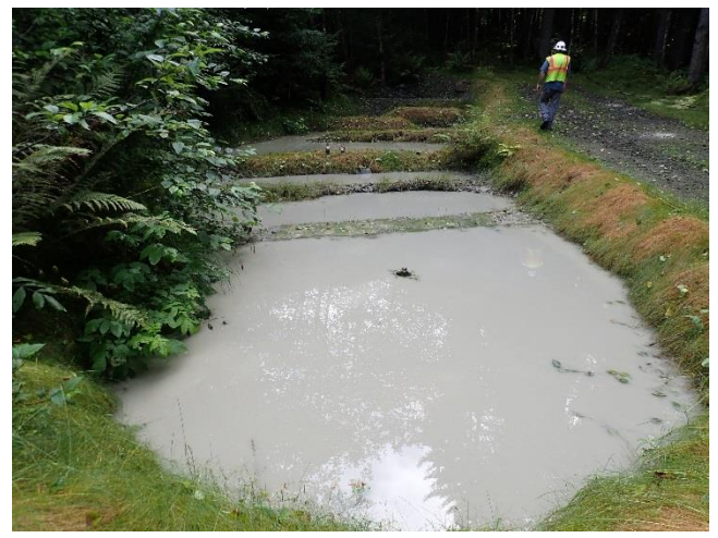
Photo 20. BMP structures located on the uphill/downstream side of Zinc Creek Bridge.