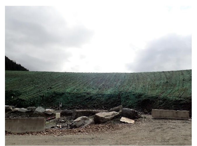
Photo 28. HGCMC TDF personnel recently applied hydroseed to the TDF slopes near pond 9.