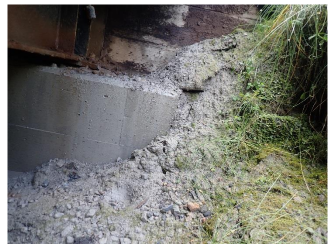
Photo 17. Residual sediments observed underneath Falls Creek Bridge.