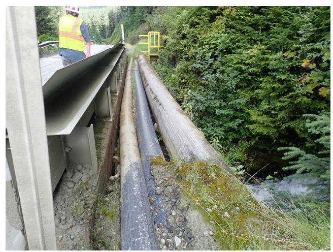
Photo 16. Falls Creek Bridge's splashguards are effectively working by preventing sediment splash over.