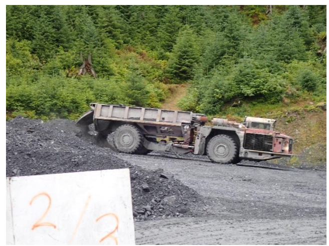
Photo 8. Class 1 waste rock being deposited at the Class 1 waste rock stockpile.