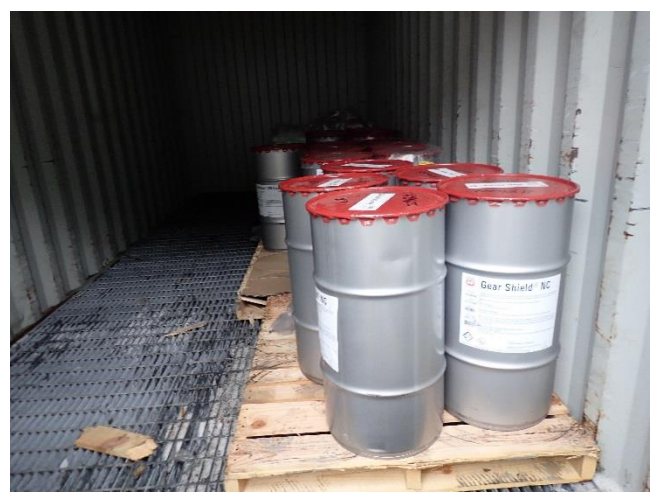
Photo 7. A 920 warehouse storage container provides secondary containment for petroleum products.