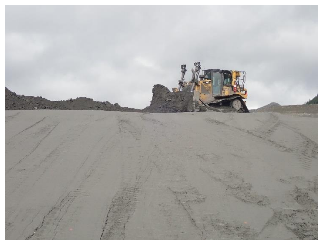
Photo 22. HGCMC TDF personnel were actively placing tailing in the S3P1 area.