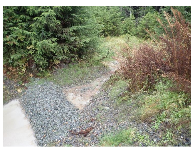
Photo 23. The final settling pond/rock check damn for the 3.2 mile B-road culvert.