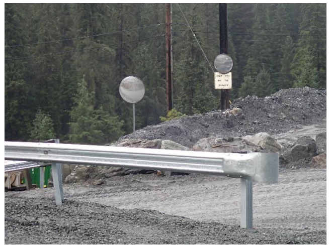
Photo 8. A new traffic mirror was installed near the 920 warehouse.