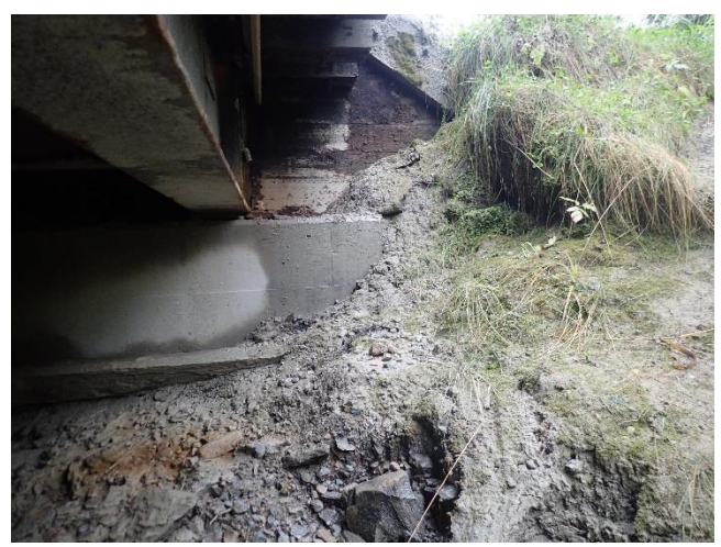
Photo 22. Sediment accumulation continues below Falls Creek Bridge.