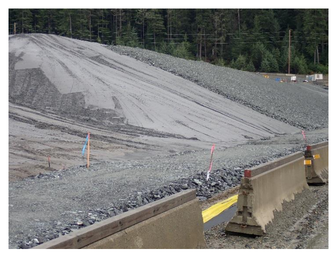
Photo 29. Class 1 waste rock was placed along sections of the outer slope.