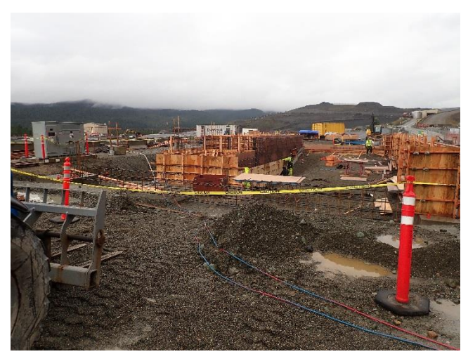
Photo 1. The new wheel wash facility is currently under construction at the TDF area.