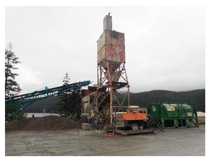
Photo 2. The temporary cement batch plant located at the Hawk Inlet facilities.