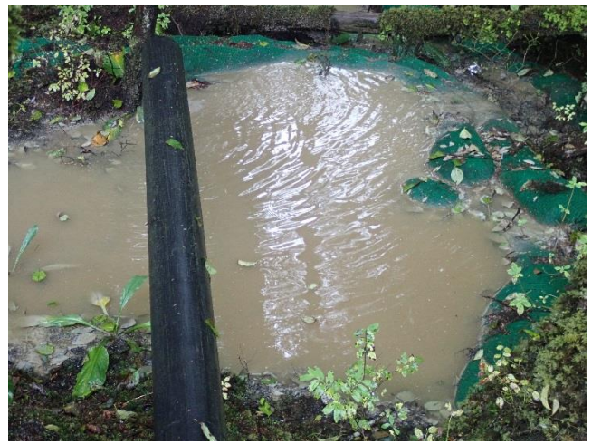
Photo 26. Turbid water observed flowing beyond the discharge point and into the forest.