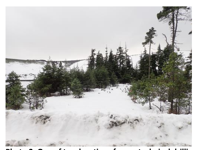
Photo 2. One of two locations for geotechnical drilling in the northern TDF area will take place.