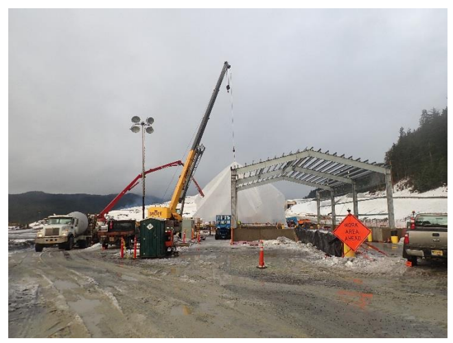
Photo 22. Contractors continue with construction of the TDF's new wheel station.