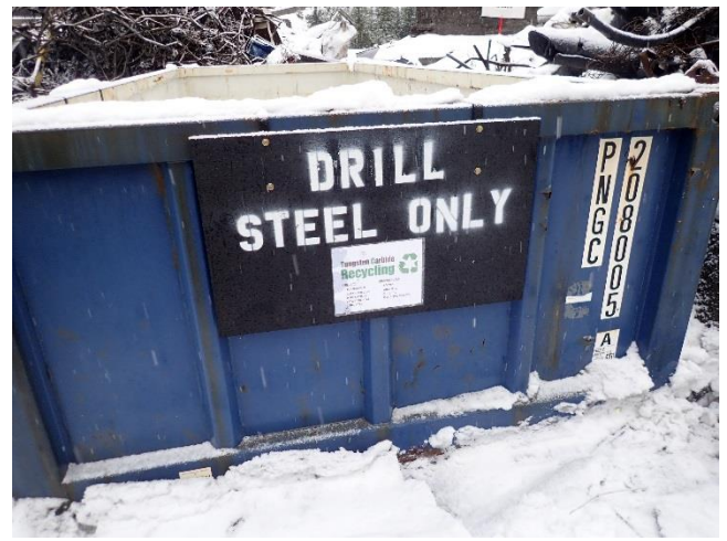
Photo 9. New storage container for used drilling steel is located in the 920 recycling staging area.