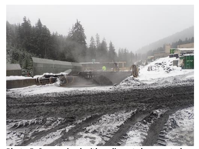
Photo 5. Snow mixed with sediments has created rugged driving conditions near the 920 Bridge.