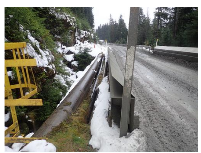
Photo 19. The splashguards are effectively working by preventing sediment splash over.