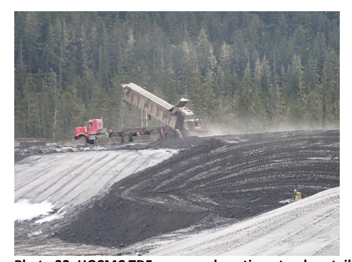
Photo 23. HGCMC TDF personnel continue to place tailings in the S3P1 area.