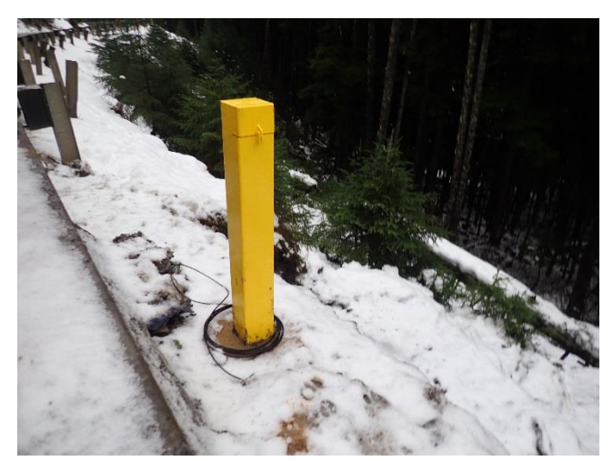
Photo 17. The inclinometers installed will be used for monitoring slope stability.