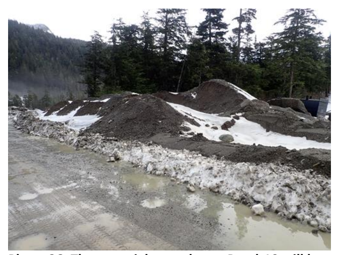
Photo 26. The material staged near Pond-10 will be used as ballast material.