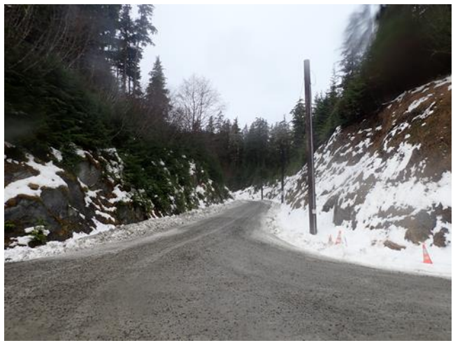
Photo 27. The end of the A-road is Young's Bay parking area for the crew bus.