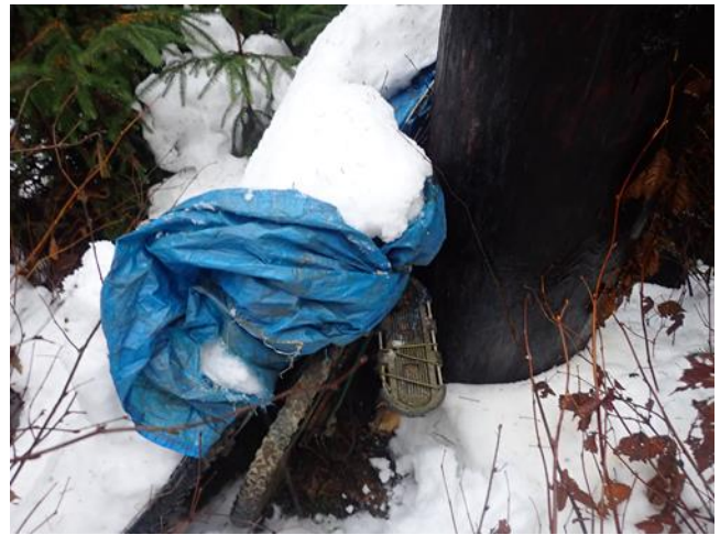
Photo 21. Two privately owned bikes were found chained to an electrical post in the vicinity of the 2.0 mile B-road,.