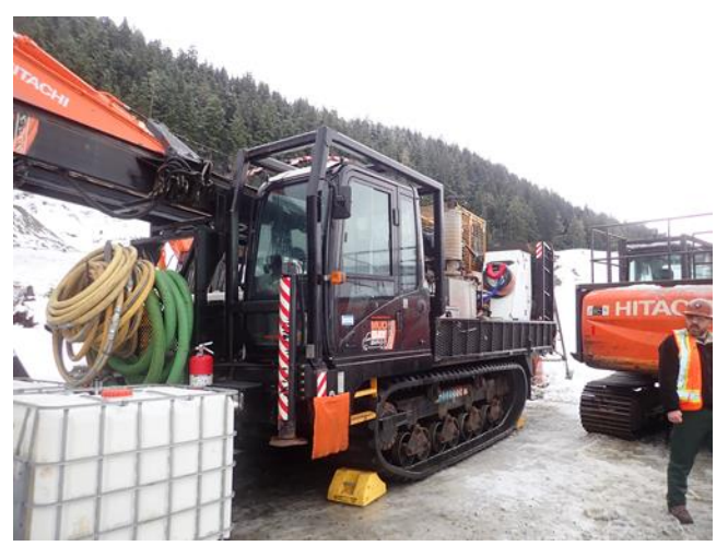
Photo 1. A drill rig that will be used for conducting a feasibility study in the northern TDF area.