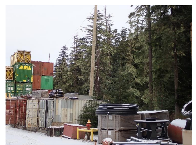
Photo 19. Additional hazard trees were observed along the perimeter of a storage area behind the housing facilities.