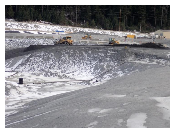
Photo 12. HGCMC continues placing tailings in the S3P1 expansion area.