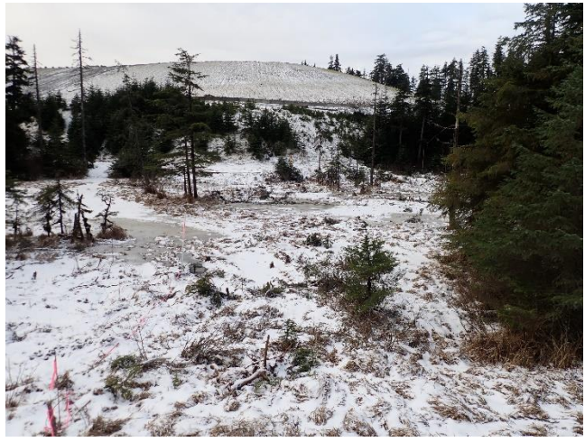
Photo 16. An additional location where geotechnical drilling will be conducted.