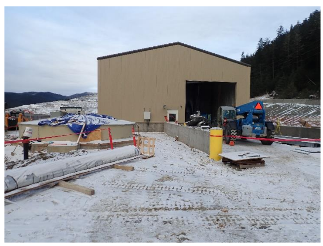
Photo 11. Contractors continue with the construction of the new wheel wash station.