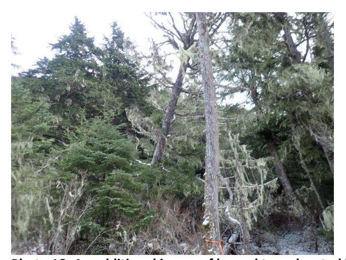
Photo 18. An additional image of hazard trees located behind the housing facility.