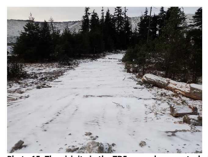
Photo 15. The vicinity in the TDF area where geotechnical drilling will take place.