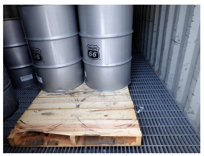
Photo 5. A storage container at the 920 warehouse with secondary containment.