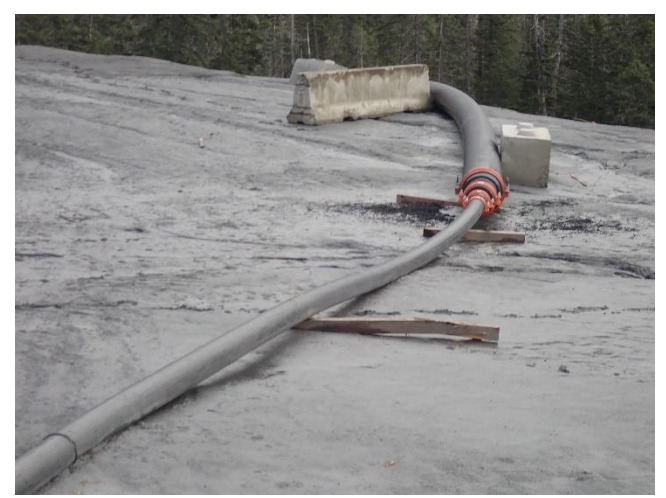
Photo 20. The wheel wash station drainage pipe routing water to Pond 7.