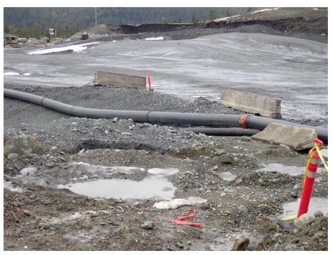
Figure 19. The wheel wash station drainpipe to Pond 7.