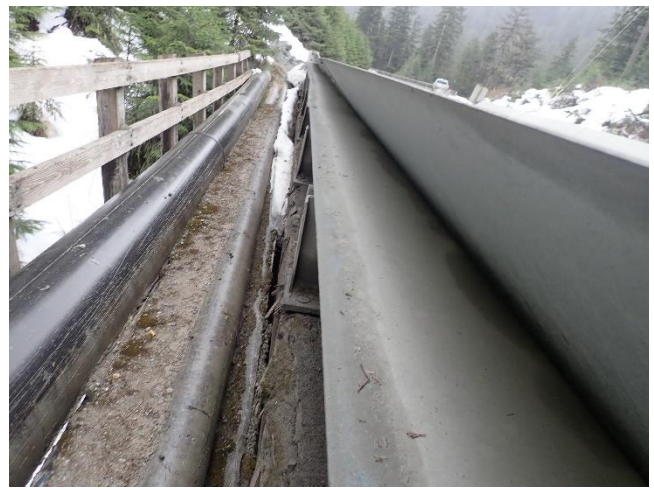
Photo 9. Splashguards are effectively working to prevent sediment splash over.