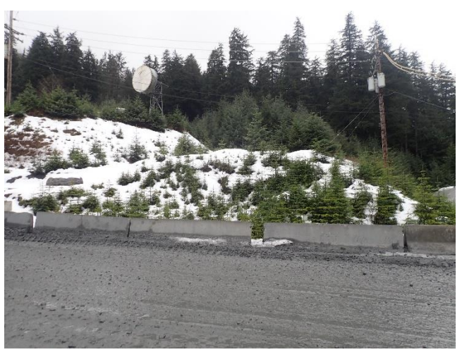
Photo 1. The proposed location for the removal of waste rock and new electrical switchgear pad.