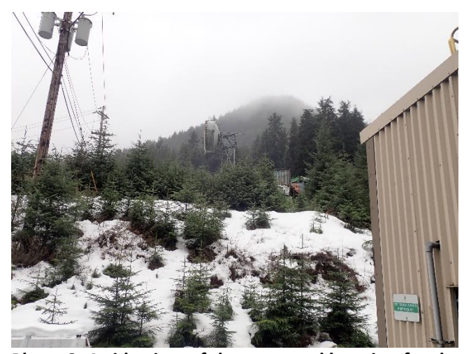
Photo 2. A side view of the proposed location for the electrical switchgear pad.