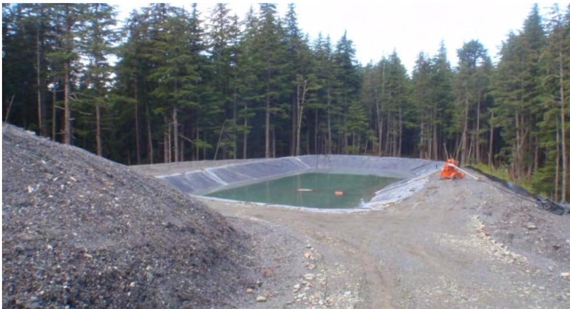
PHOTO 2. Site E Water Collection Pond, Completed and in use; October 2010