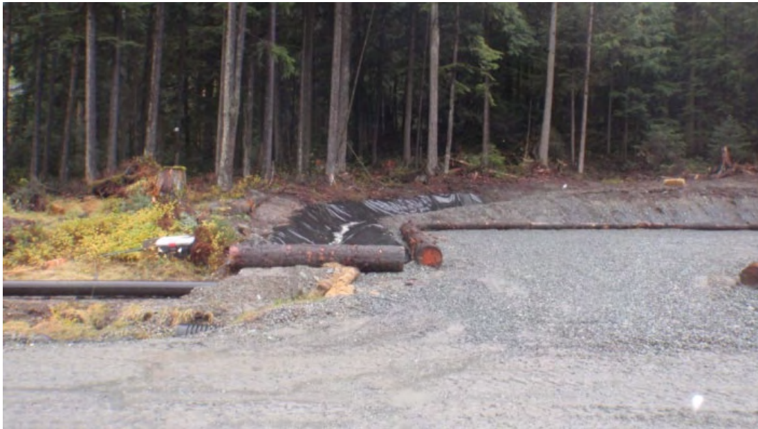
PHOTO 3. Pond C Noncontact Water Diversion Ditch and Parking Pad, September 2010