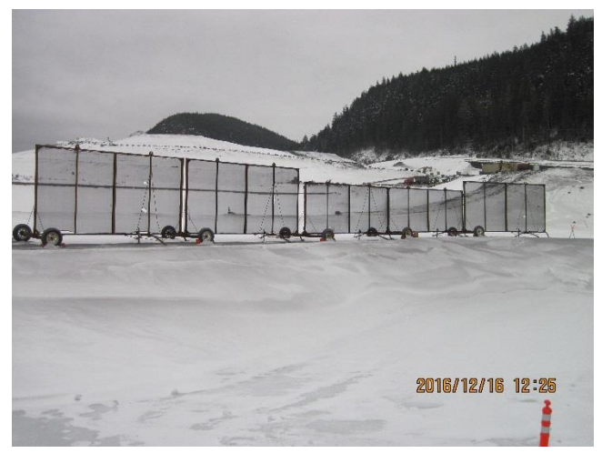
Photo 19. Portable windscreens are staged in the southern end of the S3P1 TDF expansion area.