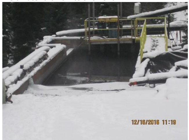
Photo 4. DB-02 sediments are captured and the water drains into 920 Pond-A.