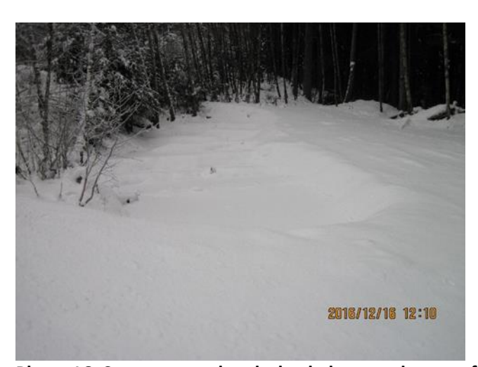
Photo 16. Snow covered rock check dams and sumps for mitigations (Zinc Creek Bridge).