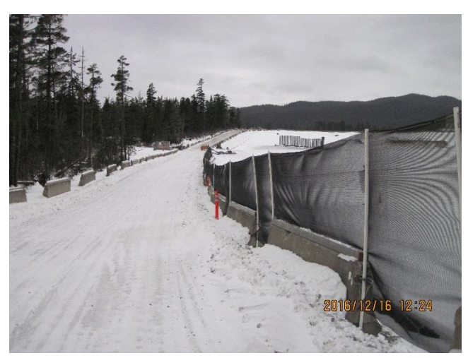
Photo 20. Fixed windscreens are positioned along the southern TDF perimeter access road.