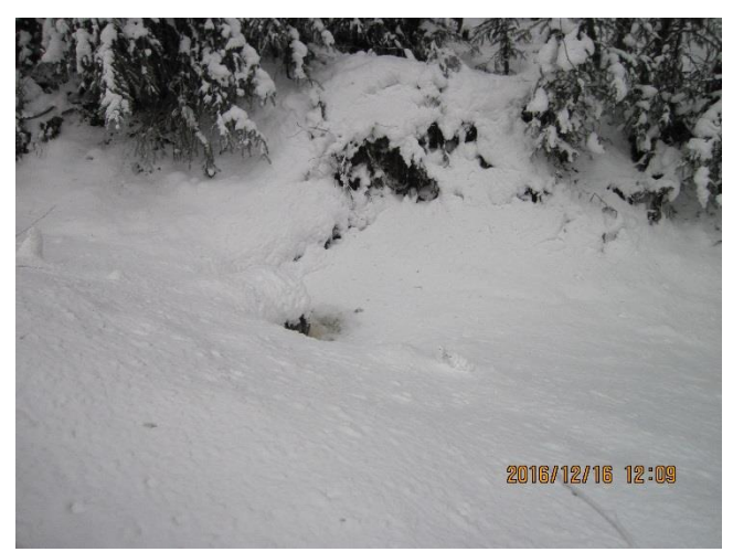
Photo 15. 3.1-mile B-road removable sediment screen covered in snow.