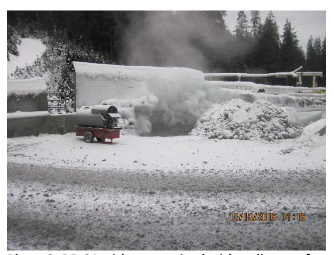
Photo 3. DB-01 with snow mixed with sediments from plowing. The sediments are captured and the melt water drains into 920 Pond-A.