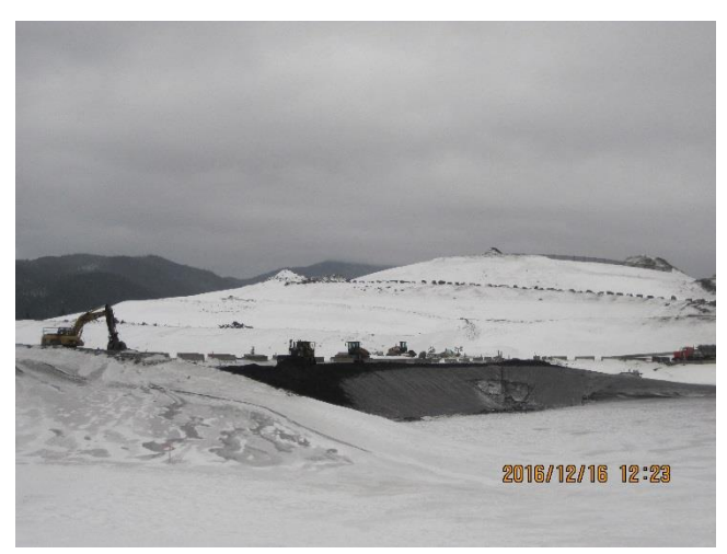
Photo 17. Tailings placement in the eastern section of the TDF expansion area.