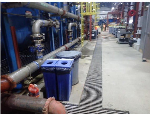
Photo 26. The TTF water treatment plant.