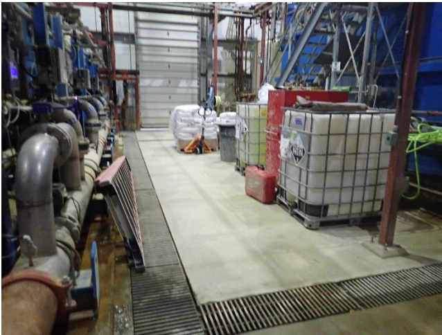
Photo 5. Inside the CWTP.