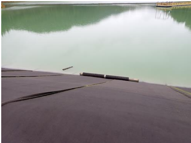
Photo 22. A section of insulated steel pipe observed along the TTF dam.