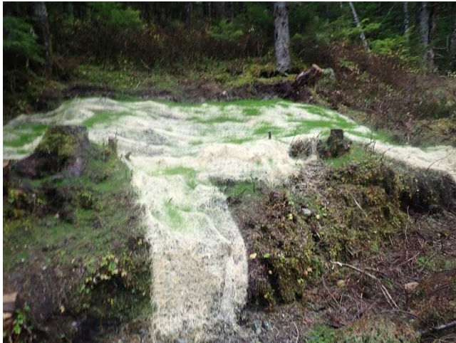
Photo 10. A reclaimed geotechnical drilling site.