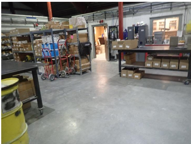
Photo 15. The Assay Laboratory.