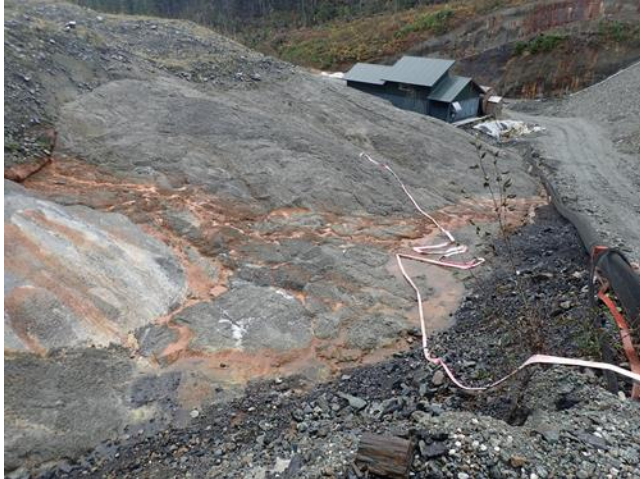
Photo 27. Concrete will need to be reapplied to a section of a GP outcrop that is generating ARD.