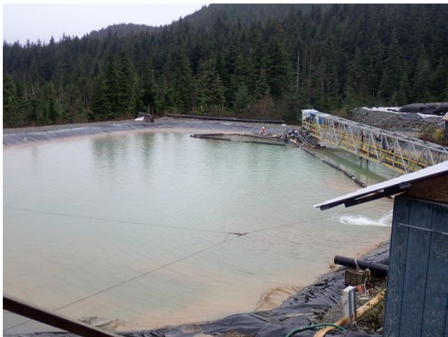
Photo 3. The CWTP's Pond 2.