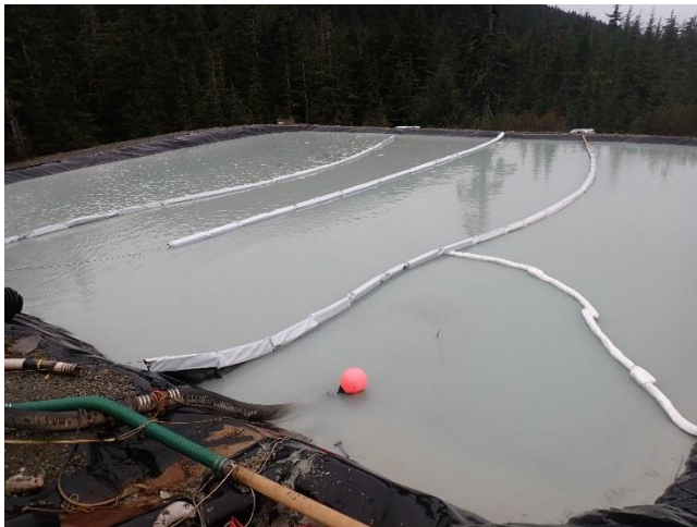
Photo 2. The CWTP's Pond 1.