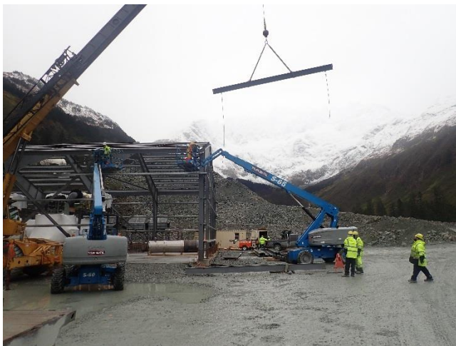
Photo 14. Contractors continue the construction of the new Powerhouse station.