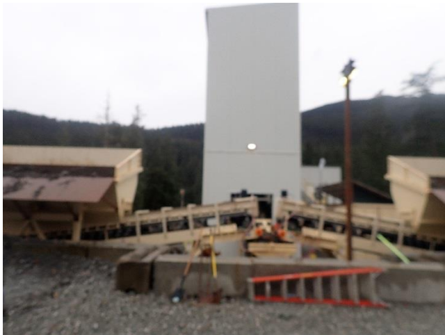
Photo 19. The Pug plant located at Pit 4.