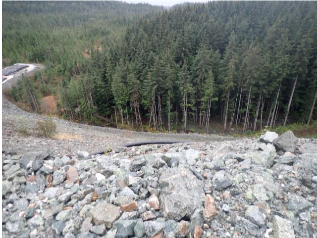
Photo 1. The Comet development pile.