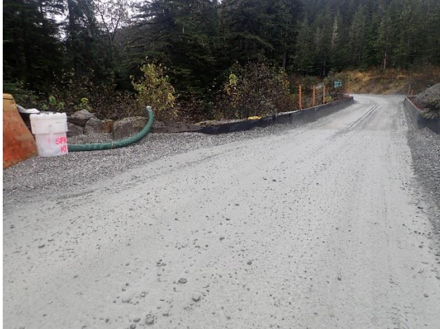
Photo 13. A portable spill kit staged near Bridge 1.