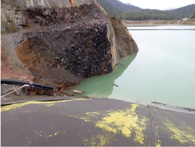
Photo 24. Logs near the southwest end of the TTF dam.