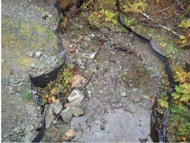
Photo 7. The silt fencing staged along the abutments of the south fork Sherman Creek Bridge.