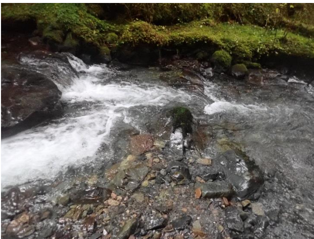
Photo 6. Sherman Creek Outfall 001.