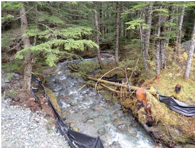
Photo 8. Silt fencing staged along the abutments of the upper Sherman Creek Bridge.