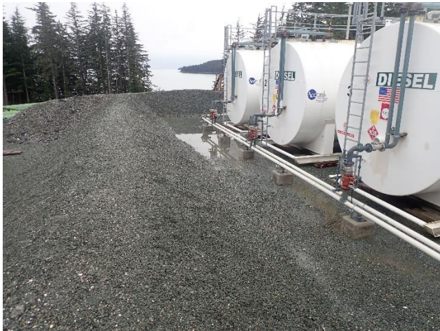
Photo 28. The fuel depot.