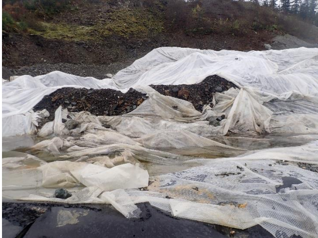
Photo 21. GP material stockpiled at Pit 7.