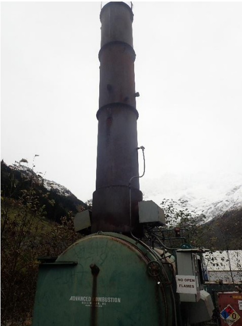
Photo 17. Coeur Alaska's solid waste incinerator.