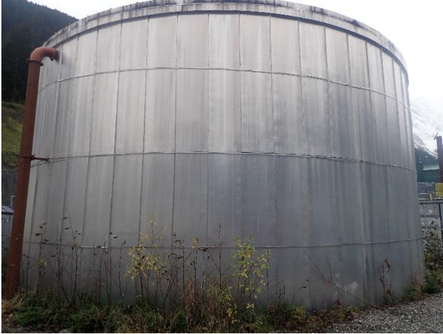
Photo 16. The firewater tank staged near the mill.