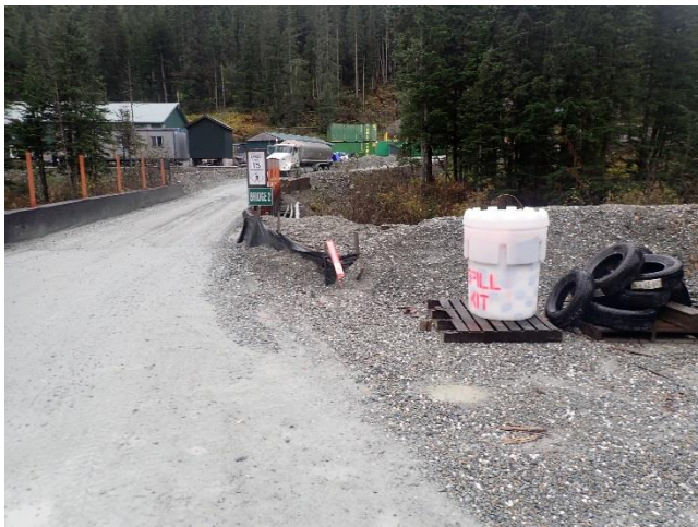
Photo 12. A portable spill kit staged near Bridge 2.