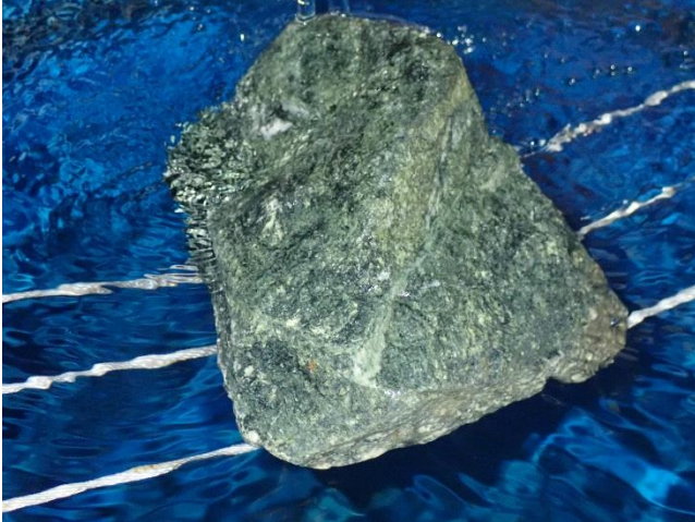
Photo 4. The CWTP's test rock that is used for monitoring white material accumulation.