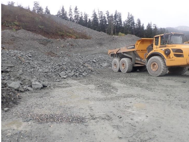
Photo 20. Waste rock stockpiled at Pit 7.