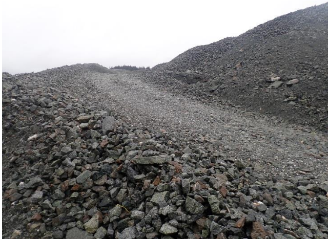
Photo 18. Pit 4. Approximately 50,000 tons of waste is currently stockpiled in this location.