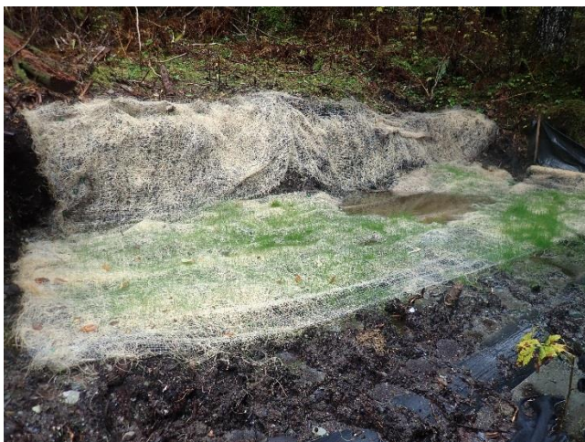
Photo 9. A reclaimed area where a geotechnical drilling pad was staged.