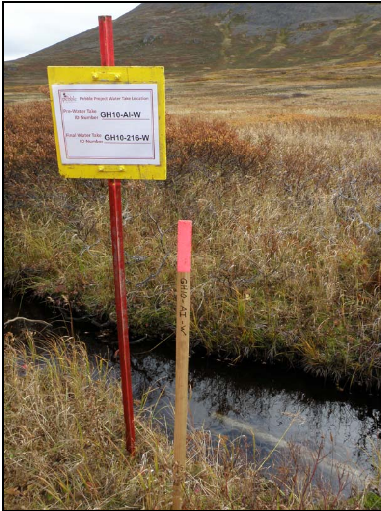
Photo 3. Sign and stake identifying the water source associated with drill hole GH10-AI.