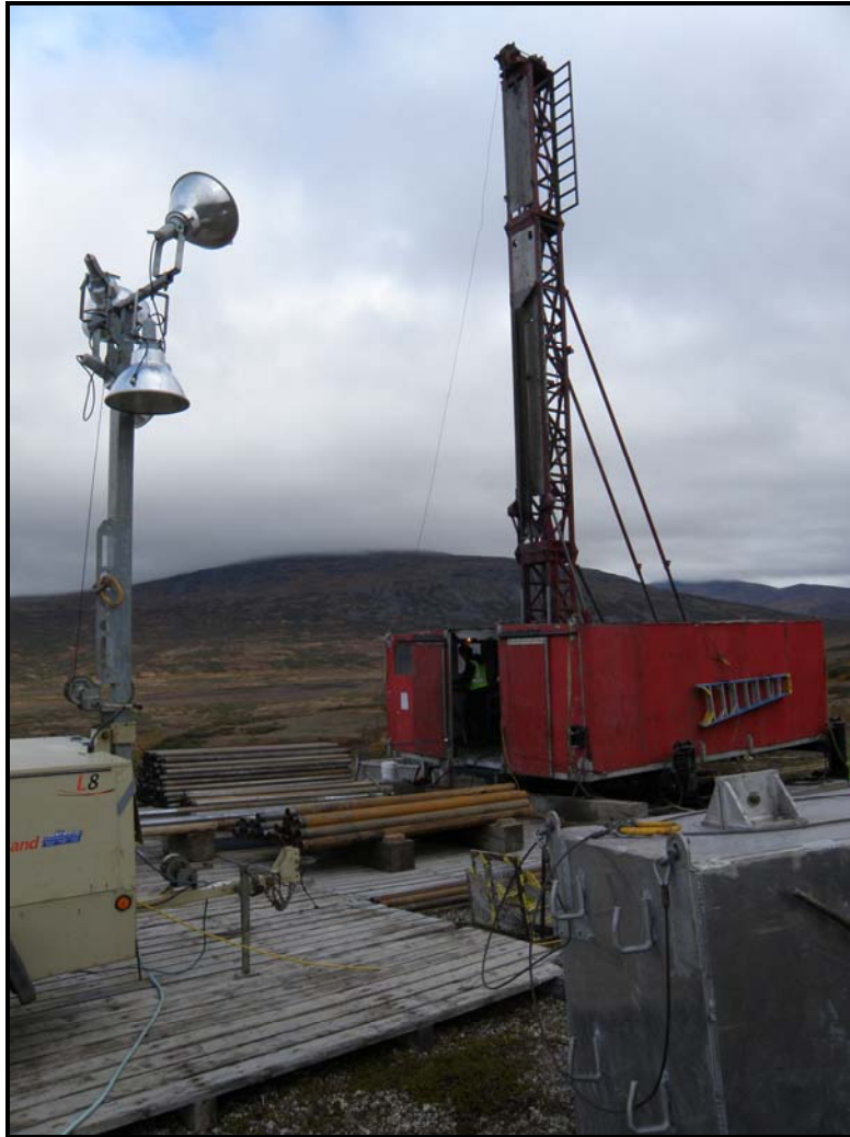
Photo 11. Drill rig at drill hole EX2010-DE. The site was just set up the morning of inspection and the rig was at 40 ft.