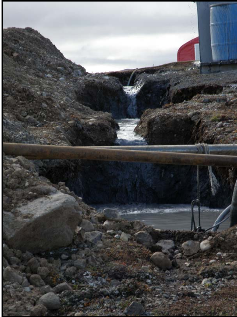
Photo 10. A series of three sump pits were in use for drill hole EX2010-AN.