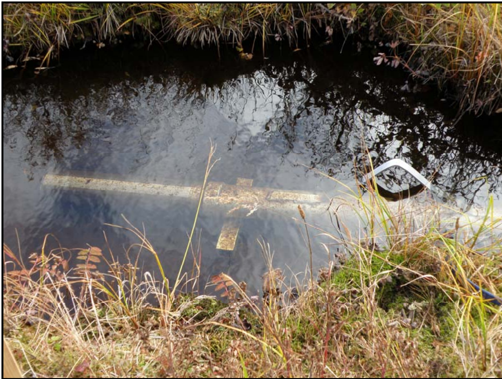
Photo 2. Close up of screened water intake structure in place in creek.