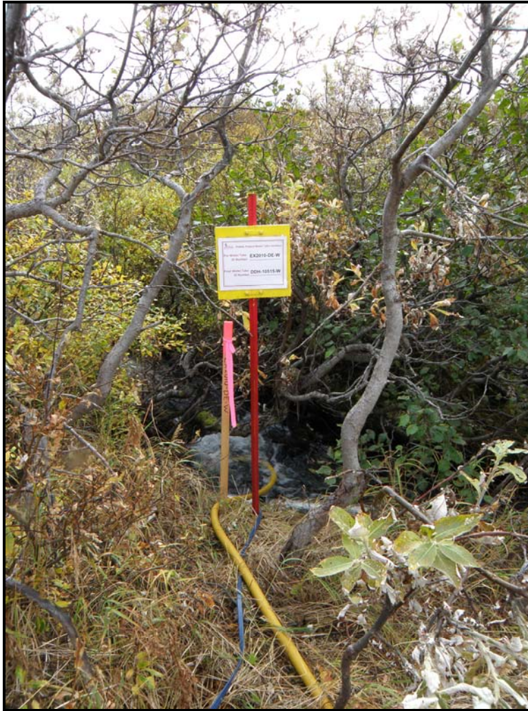
Photo 13. Sign showing pre-water take id number (EX2010-DE-W) and final water take id number (DDH-10515W). The screened water intake structure is partially visible in creek behind sign.