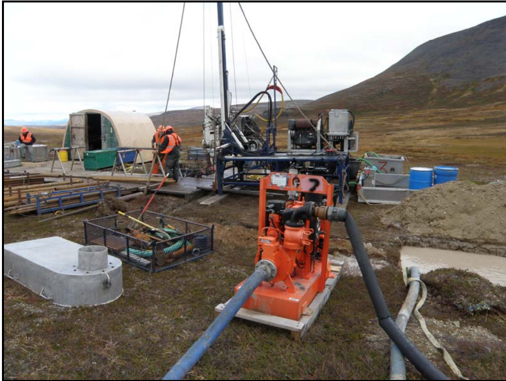
Photo 1. Foundex geotechnical drill rig (GH10-A1). Drill rig is in center of photo, to the right are the blue spill containment barrels. Also visible are sump pump and sump pit (lower right).