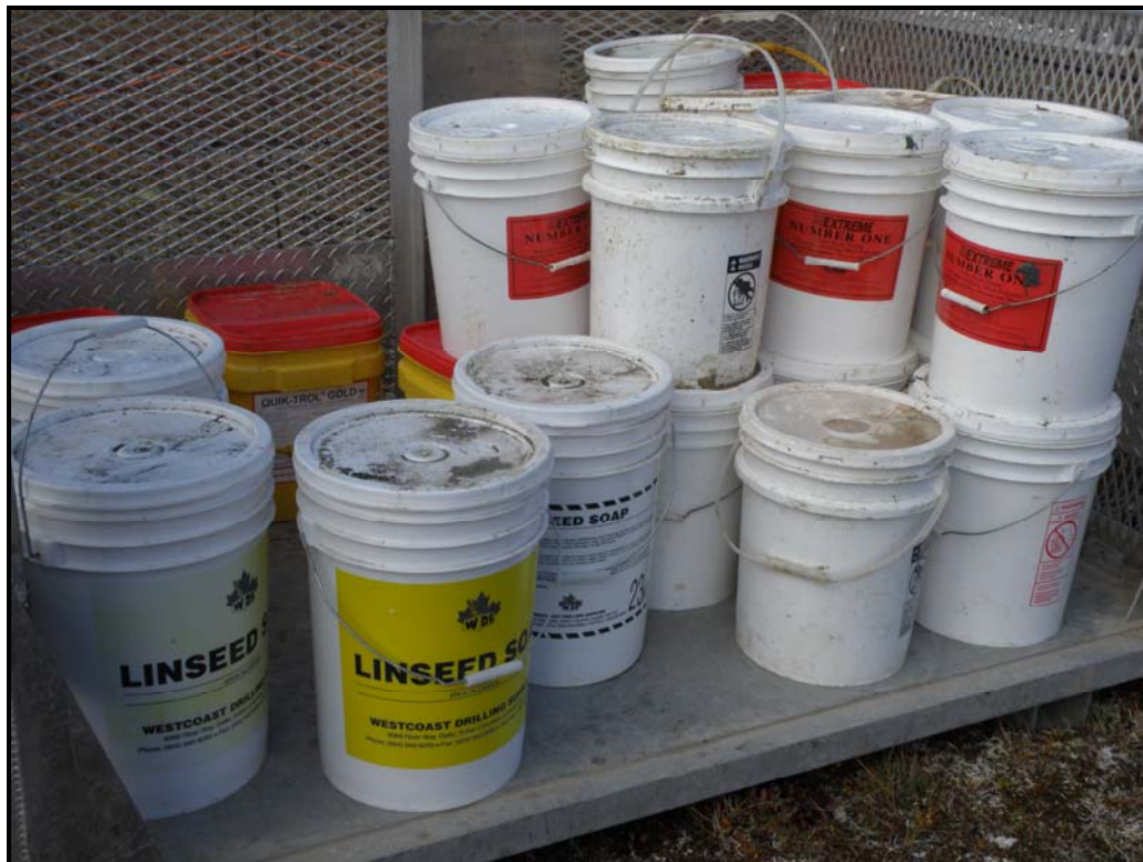
Photo 9. Additives in use at this drill site include, linseed soap, Extreme #1 Mud Polymer, and Quickrol Gold.