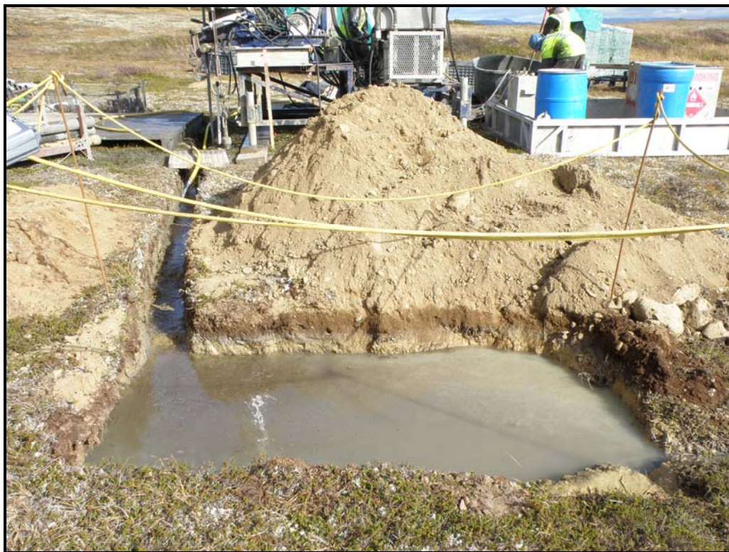
Photo 5. Sump pit for drill hole GH10-I. Because this is a smaller, geotechnical drill hole, only one sump pit was needed.