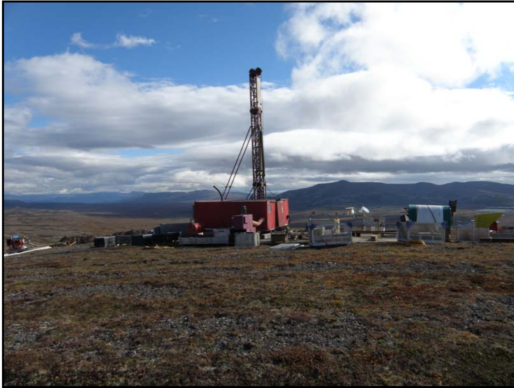
Photo 8. Overview of drill site for drill hole EX2010-AN.