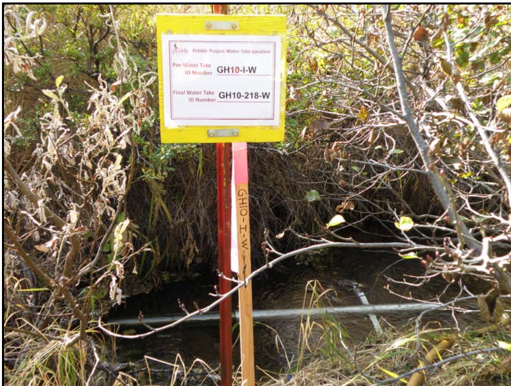
Photo 7. Sign showing pre-water take id number (GH10-I-W) and final water take id number (GH10-218-W). Screened water intake structure is visible in creek behind sign.