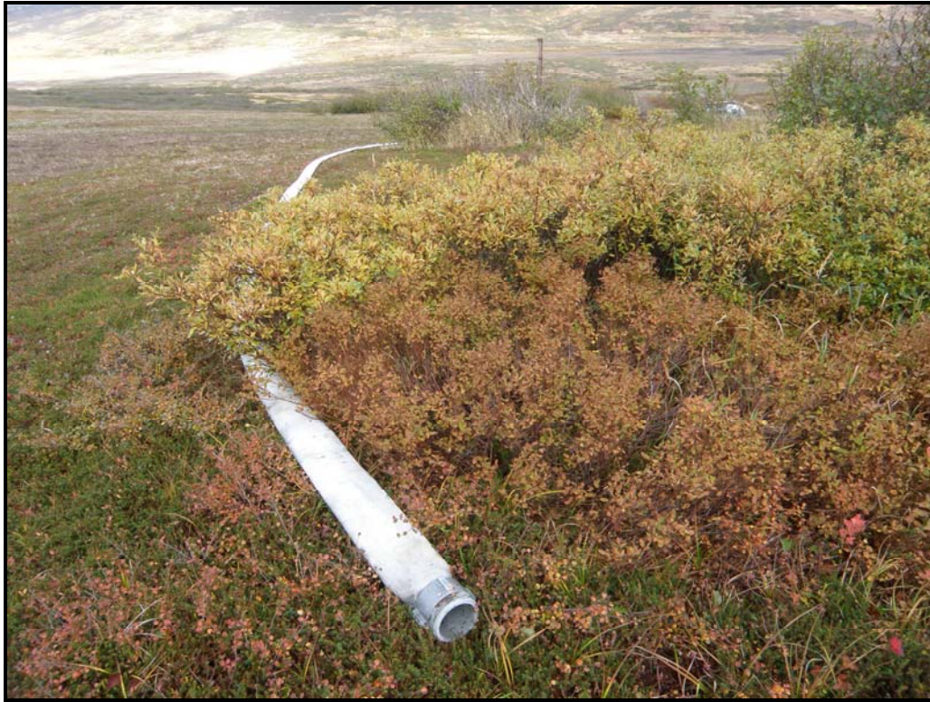
Photo 12. The end of the sump overflow hose was approximately 162 feet from the drill rig and was not in use at the time of the inspection.