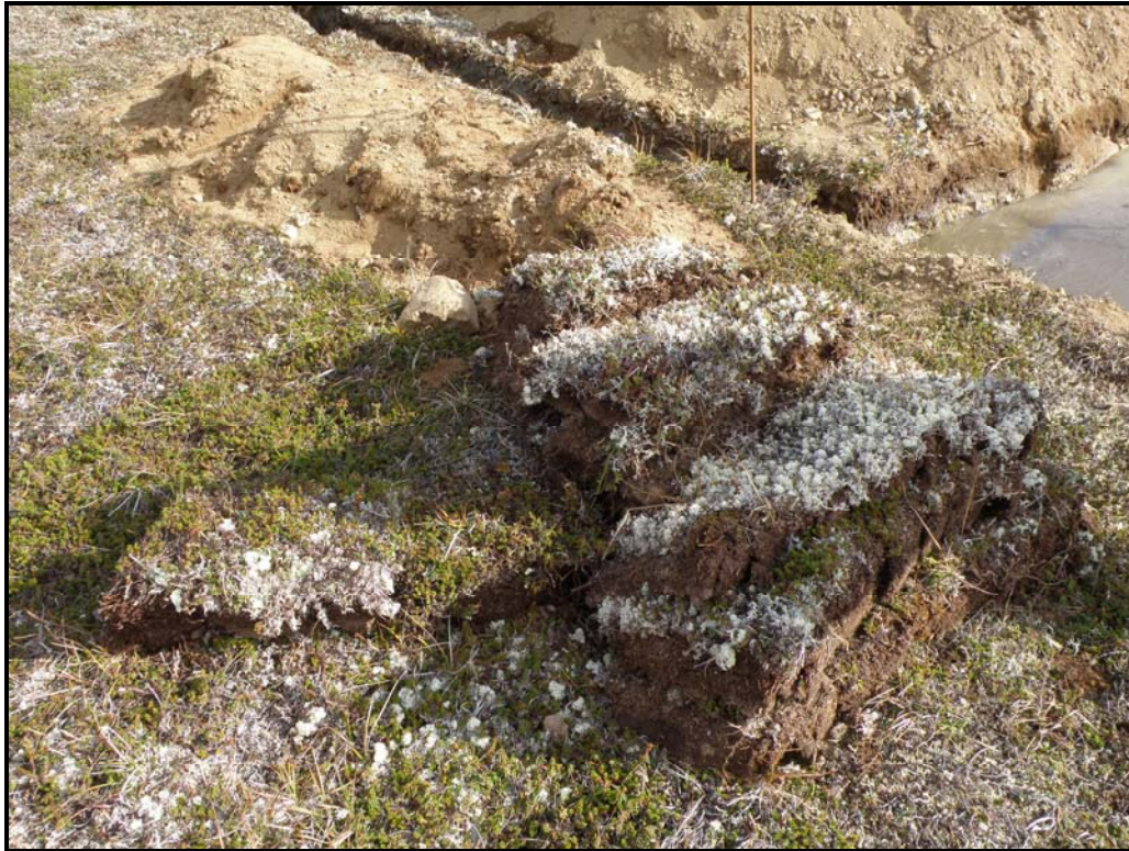
Photo 6. Stockpile of tundra mat for reuse during reclamation of sump pit.