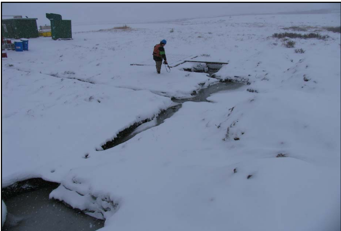
Picture 4 - DDH 077368 Sump