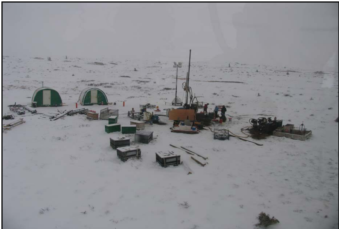
Picture 2 - Hydro-Geology Monitoring Drill Site HH07-0