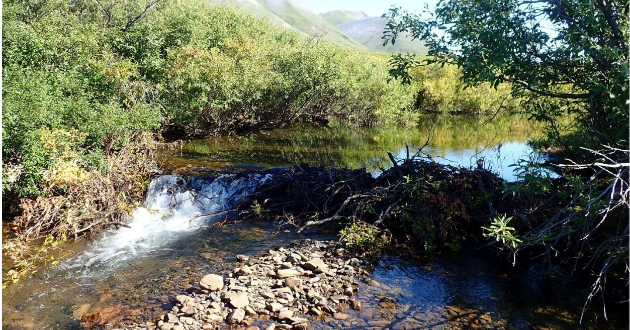
Figure 2. Small beaver dam located just upriver of uppermost minnow trap location in Anxiety Ridge Creek, August 2022.