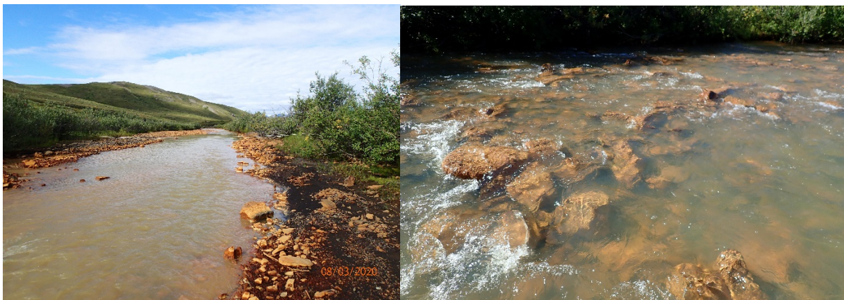
Figure 6. Red Dog Creek downstream of the north fork (Station 151) near Red Dog Mine, Alaska in August 2020 (left) and August 2022 (right).