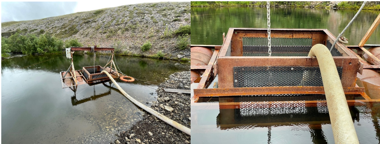
Figure 7. Water intake structure below Bons Pond in August 2022. The structure is now upright (left), but the mesh size on the screen is larger than current stipulations require (right).

On August 5 th , we drove to the area below Bons Pond to check on an intake structure that was reported to be tipped on its side and had a damaged screen (See ADF&G Trip Report from June 2022). We found the intake structure to be upright, and the outer screen had been replaced (Figure 7). However, it appeared that the mesh size is larger than the 0.25” diameter required by water withdrawal permit stipulations (Figure 7). There is not a current water withdrawal permit for this intake. ADF&G has notified Teck Environmental staff of these issues.