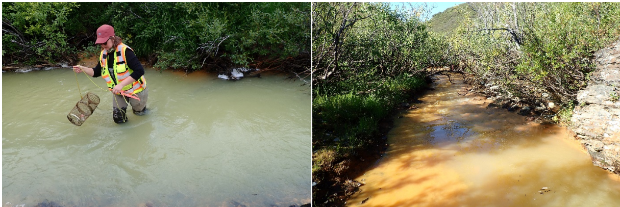
Figure 3. Lower Competition Creek (left) and Upper Competition Creek (right); August 2022.