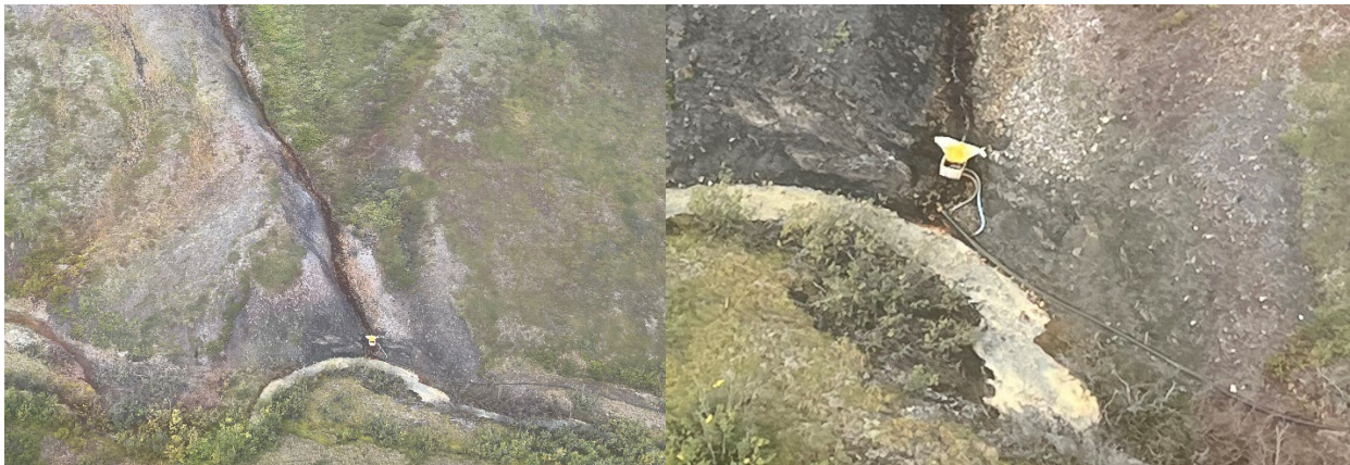
Figure 8. Kaviksaq seep near Red Dog Mine (left) and water diversion structure (right); August 2022.

On August 6 th , we flew over the Kaviksaq Seep and surrounding tributaries south of the main pit (Figure 8). A water capture/ bypass system was installed in 2020 to divert the heavy metals from the seep from Red Dog Creek. We departed the mine site that afternoon.