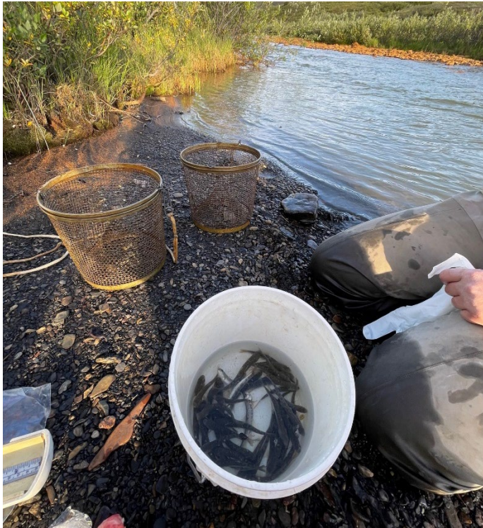
Figure 5. Juvenile Dolly Varden captured in Red Dog Creek downstream of the North Fork (Station 151) August 2022. Note the mortalities that came out of this minnow trap.

A total of 64 Dolly Varden were captured in Red Dog Creek downstream of the North Fork (Station 151). In the last four years, no more than nine Dolly Varden have been captured at this site. However, the fish captured this year appeared underweight and there were four fish that died in the time between removal from the trap and being measured for length (Figure 5). These fish mortalities were all smaller than the established size threshold for tissue element analysis (90-140 mm), but we chose to retain them for examination of elemental anomalies. Red Dog Creek still appeared red and turbid as in recent years (Figure 6).