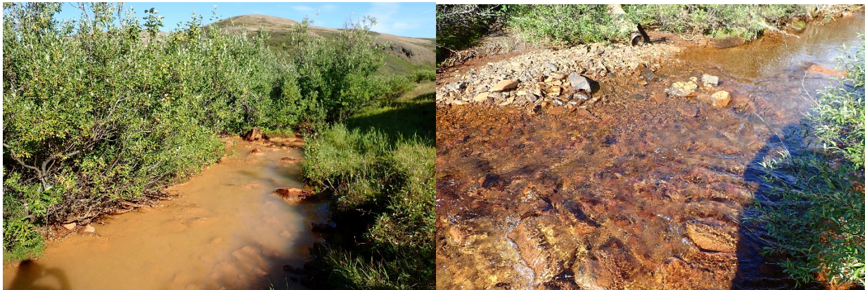
Figure 4. Sourdock Creek (left) and West Fork Ikalukrok Creek (right); August 2022.