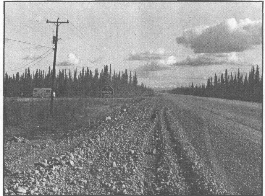
Many views are limited to roadside establishments and right of way vegetation due to the flat terrain and dense spruce forest.