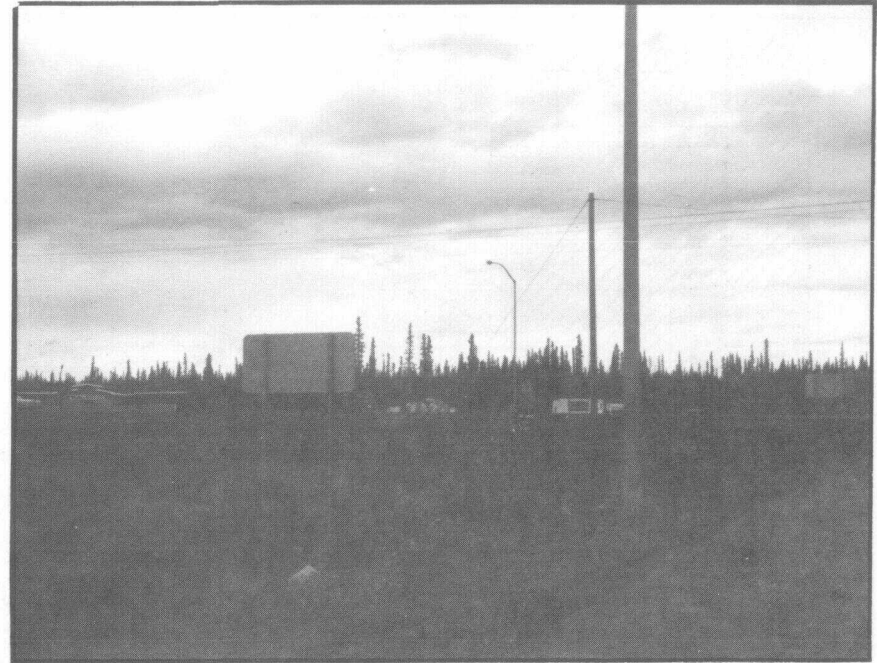
The Glenn Highway junction could be enhanced with aspen and birch plantings within the right of way.

The right-of-way and land immediately adjacent to it are particularly important in this management unit because so much of the viewing experience is limited to these areas. Along roads, scenic resource management commonly utilizes two management strips - the right-of-way and the area immediately beyond, commonly referred to as a greenbelt. Here the right-of-way, under the management of the State DOTPF, is the area where there is the greatest potential for effective scenic resource management. Beyond the right-of-way, the diversity of land owners, their varying needs for the use of this land and the