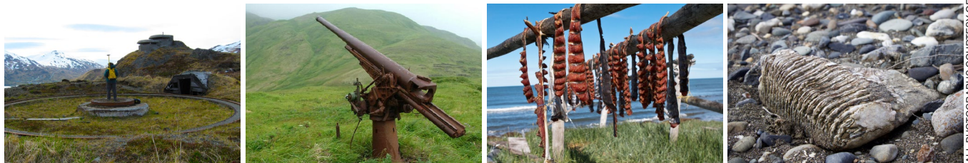
Mining and military