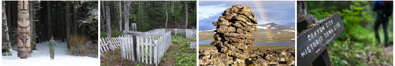
Totems, graves/cemeteries, cairns, signposts, monuments