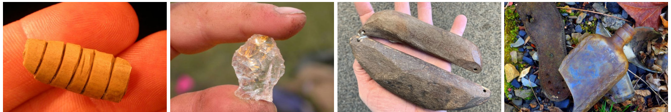
Stone, bone, wood, metal tools and artifacts, historic cans/housewares, beads, pottery/porcelain