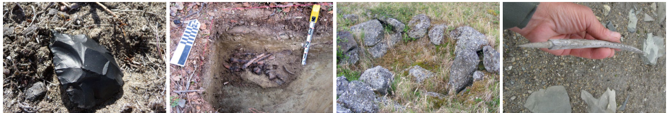
Concentrations of bone, stone, wood, metal tools/artifacts, pottery, glass, rock rings, house pits/depressions