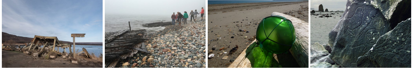
Pilings, shipwrecks/watercraft, potentially-historic marine debris, petroglyphs