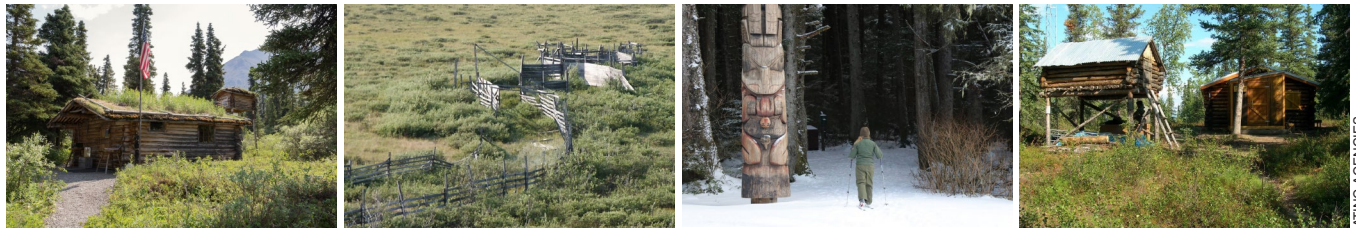
Cabins, churches, trails, corrals, railroad tracks, totems, abandoned buildings, caches